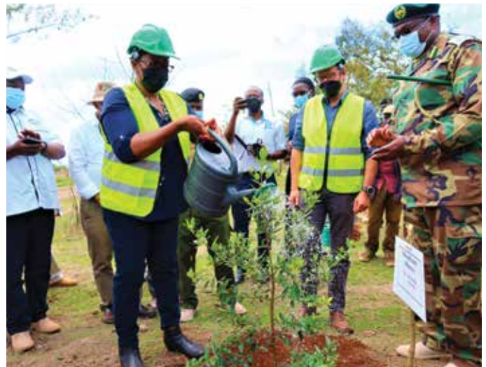
Guests planted trees to commemorate the solar electric fence