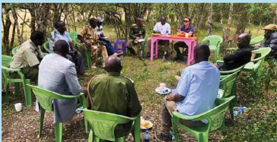
Fence Technical Committee