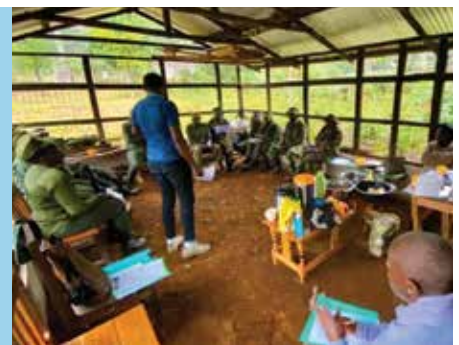
Sensitization meeting in progress

Rhino Ark held a series of meetings with Chehe Community Forest Association and scouts to build on a joint forest collaboration to conserve the Chehe forest. Forest adjacent communities prove to be conversant with the forest and as such, collaborating with them is beneficial in achieving conservation assignments.