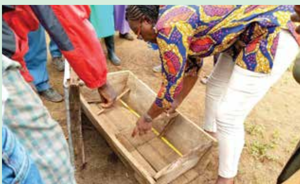
Honey expert inspecting a traditional beehive