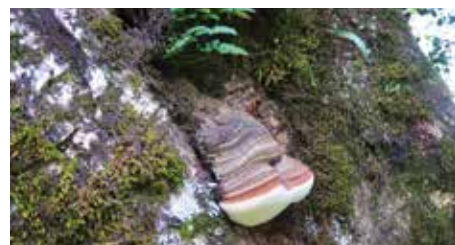
Mould on trees