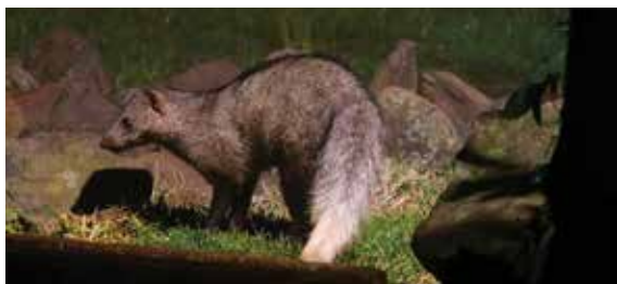
White tailed Mongoose