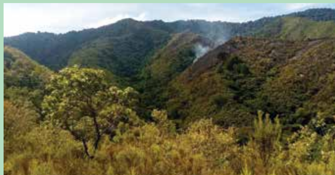
The wildfire in Eburu forest

Rhino Ark have been instrumental in providing water and driving it to the fire sites, with women from the CFA carrying it through the bush in buckets to the firefighters. The effort of the community in volunteering their time to help in protecting the forest reflects the spirit of partnership and is particularly appreciated.