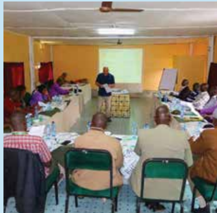
Participants at the meeting

This will ensure the judicial process; from investigation, prosecution to adjudication of wildlife cases is successfully handled.