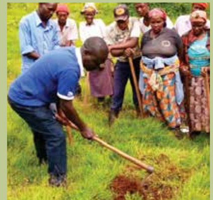
Rhino Ark Outreach Officer demonstrates how to maintain the replant site