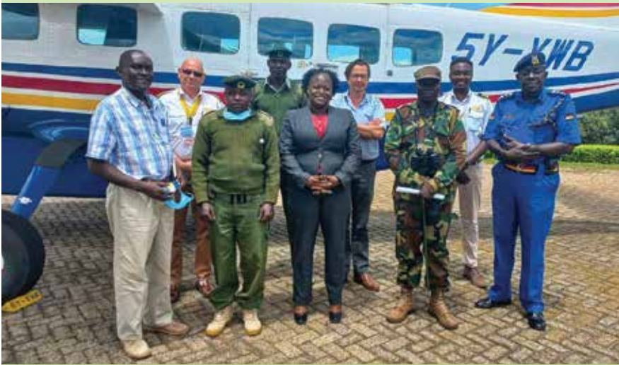
Aerial surveillance team

In December 2021, Rhino Ark organized a surveillance flight over South Western Mau forest. The team comprised members drawn from Rhino Ark, Kenya Forest Service, The Judiciary and The Kenya Police Service.