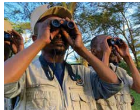
The conservation champions using their binoculars