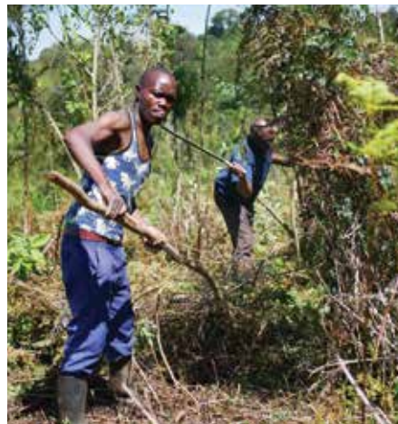
Youth taking part in the rehabilitation programme