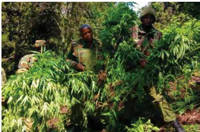
AJSU Team during surveillance

The prevailing dry conditions and powerful winds were major contributors to the fire's rapid spread, which was further compounded by the multiple points started by suspected arsonists.