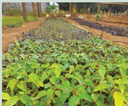
Tree seedlings that are ready for planting