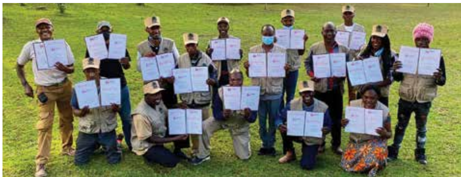
The conservation champions receiving their First Aid and Fire Safety certificates

We look forward to seeing the results of their efforts soon. In addition to the training courses, this group of enthusiastic naturalists participate in monthly bird watching and medicinal plant identification training days. All received binoculars to aid in bird spotting.