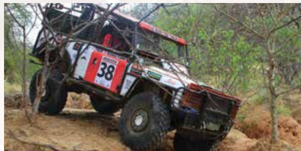
Over 45 million shillings The Avery's Bundufundis Team (1996-2021) Car 38