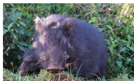
Giant Forest Hog