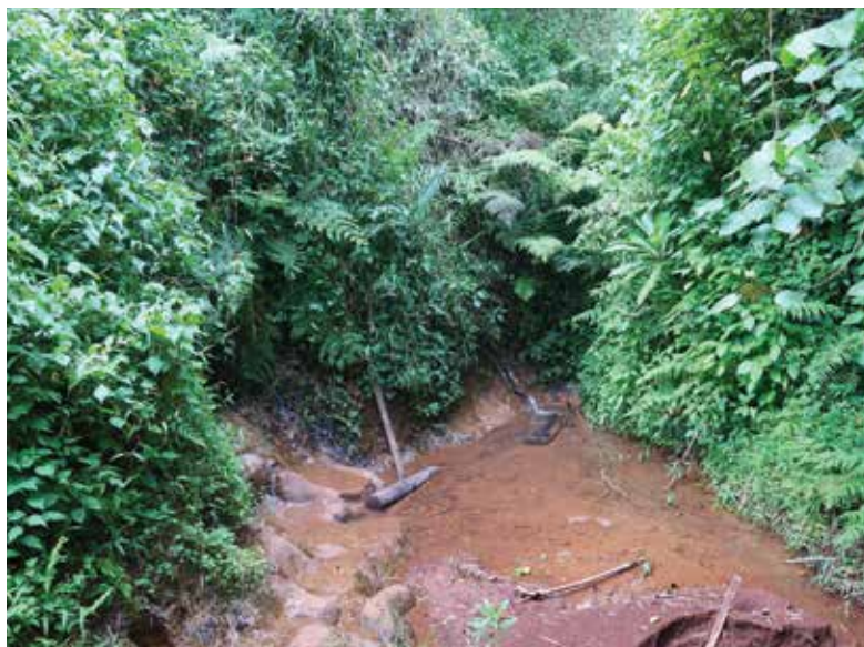
A water springs at Tirigoi forest