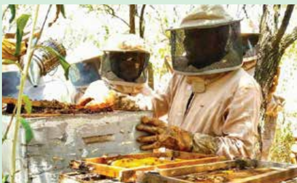
Beekeepers harvesting honey during the training session