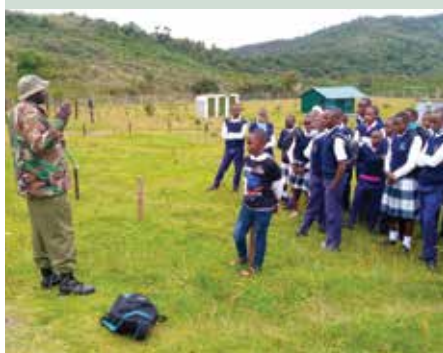
Kahuho Secondary School pupils during the visit to Eburu forest

They also visited the Kengen plant, natural sauna, had lectures on the endangered mountain bongo, took a walk along the Eastern Summit to Kimororoch junction and finally enjoyed a taste of pure natural honey, experiencing the Ogiek community's expert harvesting. This visit, which greatly inspired the pupils, has awakened in them a fire to be more involved in conservation efforts.