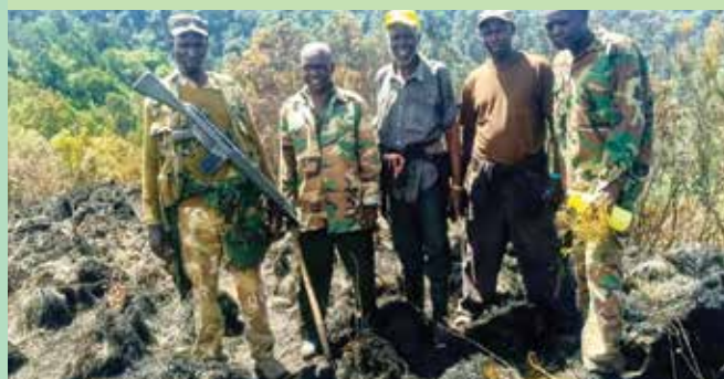
Joint effort to save Eburu from wildfire