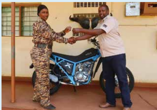
Kenya Wildlife Service Meru Station Officer receives a brand new motorcycle from Rhino Ark

The model of fence supervision using a motorcycle was piloted in Phase 1 and Phase 2 of the Mt. Kenya Fence and has proved to be very effective. Previously the Fence Supervisor depended on public means of transport or KWS sector warden vehicle. With the motorcycle the Fence Supervisor can independently run his programme thanks to the UNEP - African Elephant Fund.