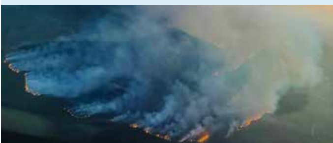
Mt Kenya Fireline