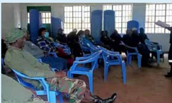
Attentive rangers during training

The timing of the training is meant to equip the firefighters in readiness for the next fire season. Forest stations targeted included; Nanyuki, Ontulili, Marania, Muccheene, Meru, Ruthumbi, Chogoria, Narumoru, and Gathiuru.