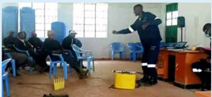
A Firefighter from Mt Kenya Trust conducts the training