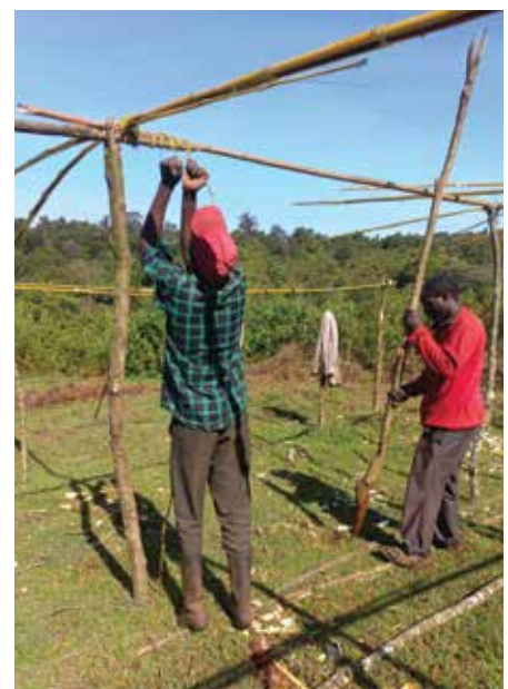
Building a tree nursery shade