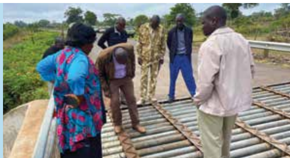
Team inspecting Kithoka wildlife grid

During the inspection, all aspects of the grids were examined. Despite the heavy loads on the road that connects Isiolo and Meru towns, the grids have been effective. The inspection team also discussed some upgrades to be implemented.