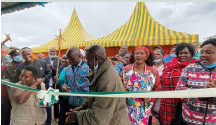
Official opening of Eburu Community Forest Association Office

these ensure that community members benefit directly from the conservation of our mountain forests.