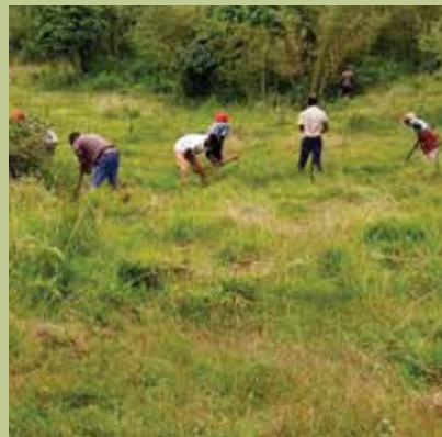
Community conducting seasonal rehabilitated site maintenance

16,000 tree seedlings planted on the 10 hectare Kapkembu forest rehabilitation site in South Western Mau forest are flourishing under a careful maintenance regime. The replant site, located near Kapkembu forest outpost is supported by Platinum Credit Ltd.