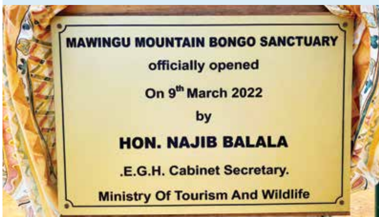
Mawingu Bongo sanctuary plaque

It was a monumental day for Mountain Bongo conservation in Kenya and Rhino Ark is proud to be a partner in the national bongo recovery conversation.