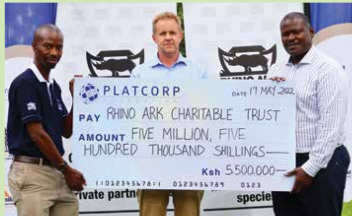
Platcorp cheque handover at Rhino Ark HQ

This comprehensive system will include micro fencing and posting of community scouts to protect the fragile indigenous seedling to ensure that they survive.