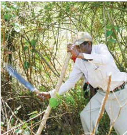
Clearing the Tirigoi site

This initiative is part of a broader effort by various organisations to restore the expansive South Western Mau Forest Reserve that long suffered the ravages of illegal human activity.