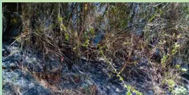
A section of the destroyed forest