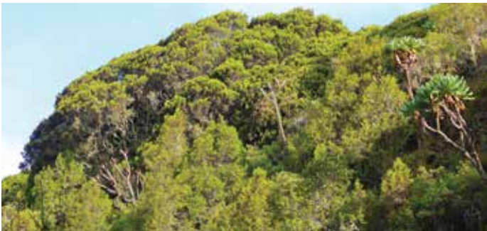
Aberdares forest cover