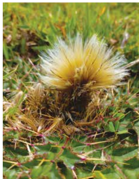
A wild flower