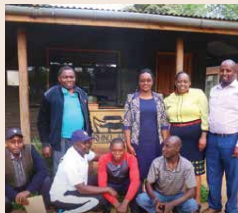
Supervisors of the Mt. Kenya School of Hope end of year meeting