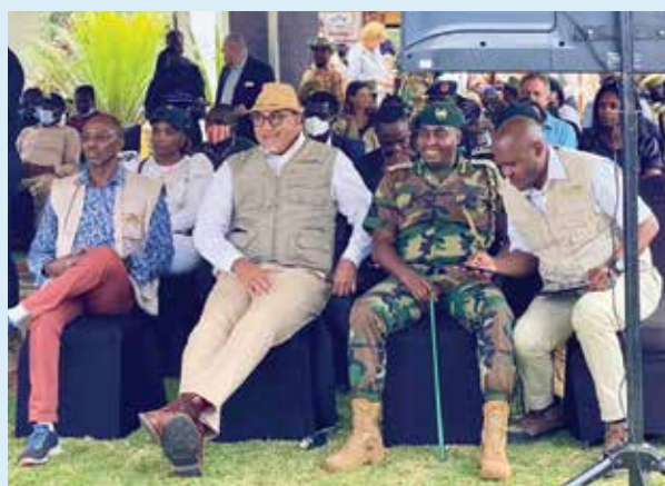
CS, Najib Balala and other dignitaries at the launch