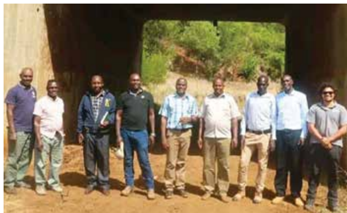
Team from Uganda Wildlife Authority at the Mt Kenya wildlife underpass