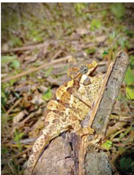
Von hornel's chameleon