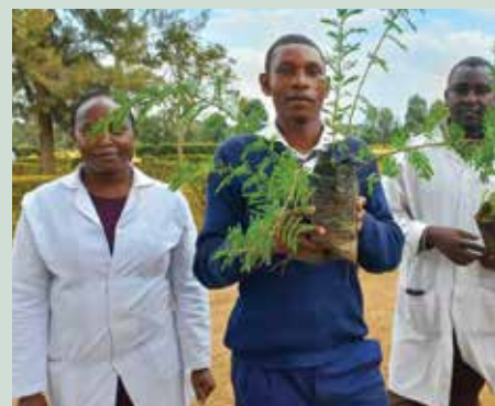
A student holds up a seedling