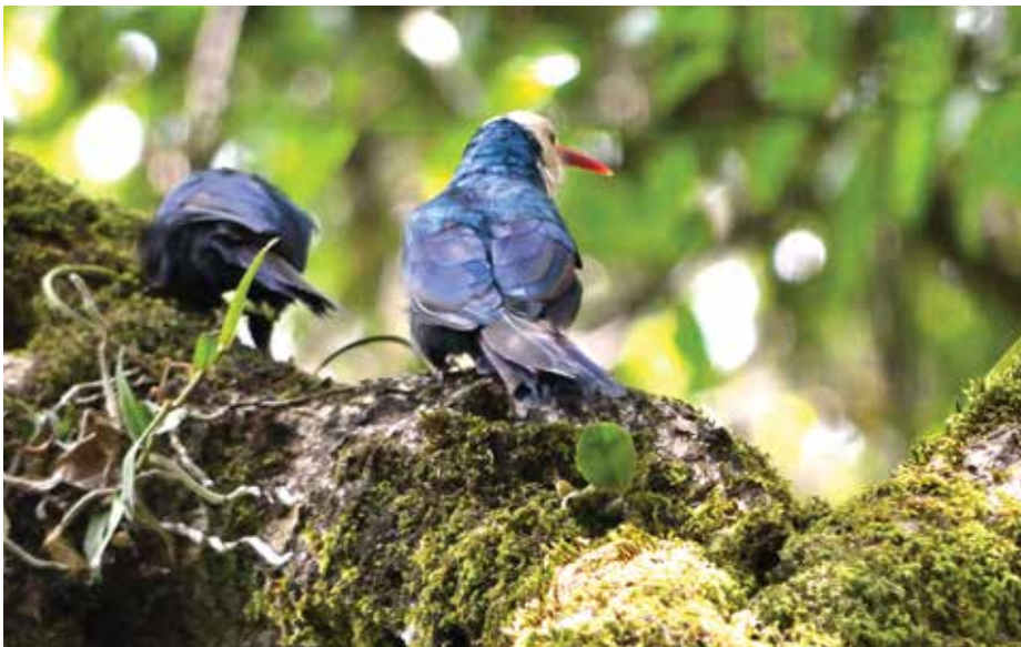
White Headed Wood Hoopoes