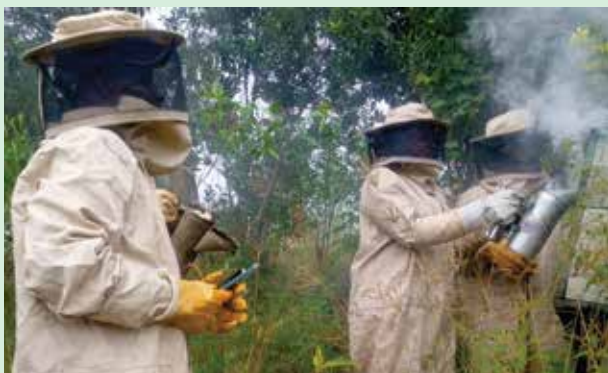
Beekeepers using smokers to calm bees during training

The Eburu Natural Forest Honey Cooperative members have now been trained on how to better manage bees and establish bee hives in a way to keep out honey badgers. Honeybees as pollinators, have an essential role in maintaining Kenya's mountain ecosystems.