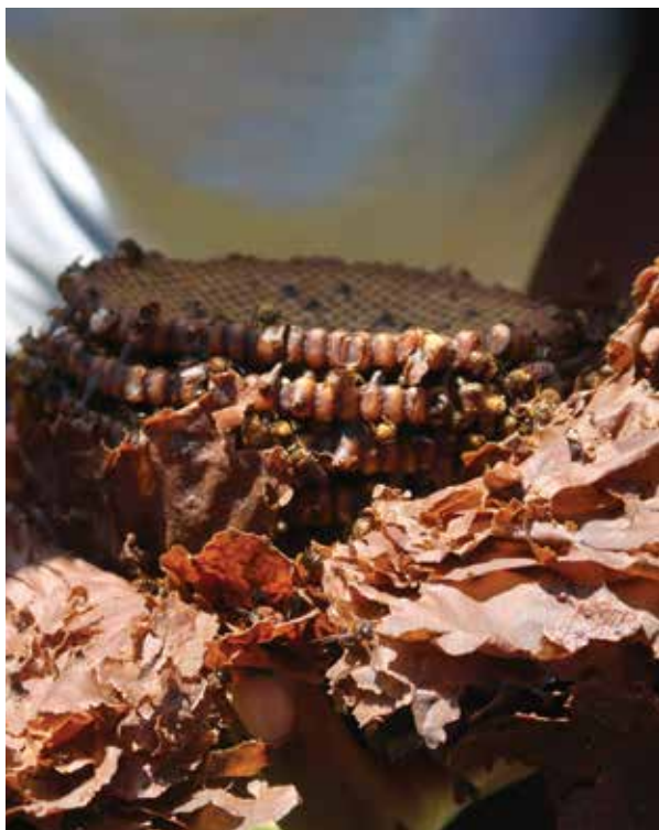
Honeycomb of ground dwelling bee species