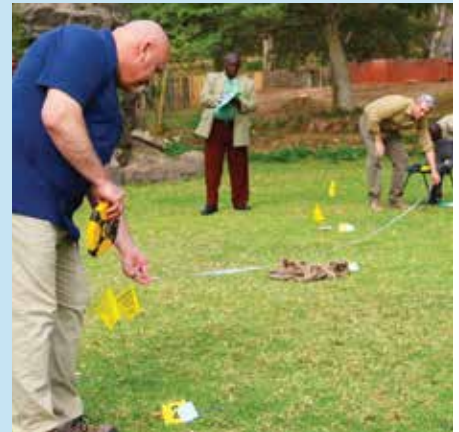
Crime Scene Investigation Training in progress