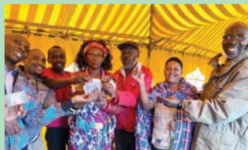
Eburu CFA members receiving ID cards

The Eburu Forest Community Forest Association (ECOFA) membership registration exercise is funded and supported by the Rhino Ark/Calgary Zoo Mountain Forest Conservation Partnership.