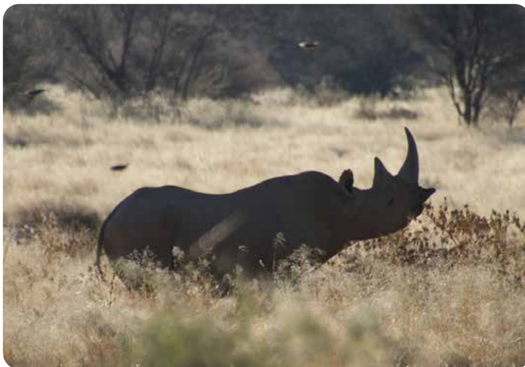
Black rhinoceros ( Diceros bicornis ).

The white rhinoceros Ceratotherium simum and black rhinoceros Diceros bicornis ranging in Africa are listed in Appendix I, except for the white rhinoceros populations of Eswatini and South Africa which are listed in Appendix II for trade of live animals and hunting trophies.