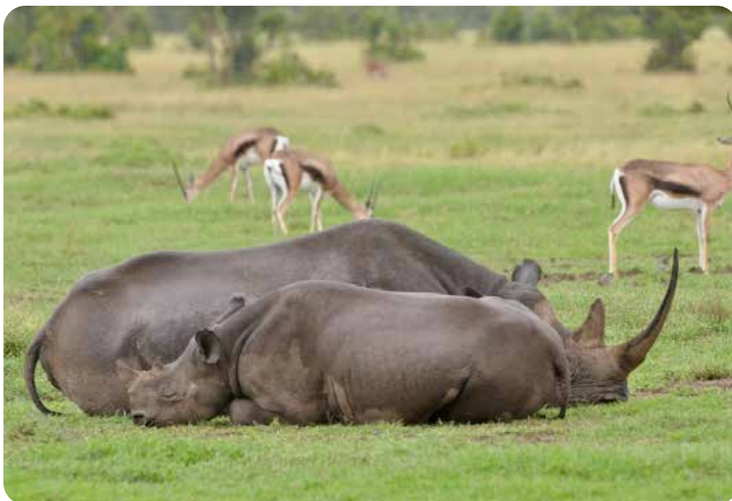
Black rhinoceroses ( Diceros bicornis ).

The white rhinoceros Ceratotherium simum and black rhinoceros Diceros bicornis ranging in Africa are listed in Appendix I, except for the white rhinoceros populations of Eswatini and South Africa which are listed in Appendix II for trade of live animals and hunting trophies.