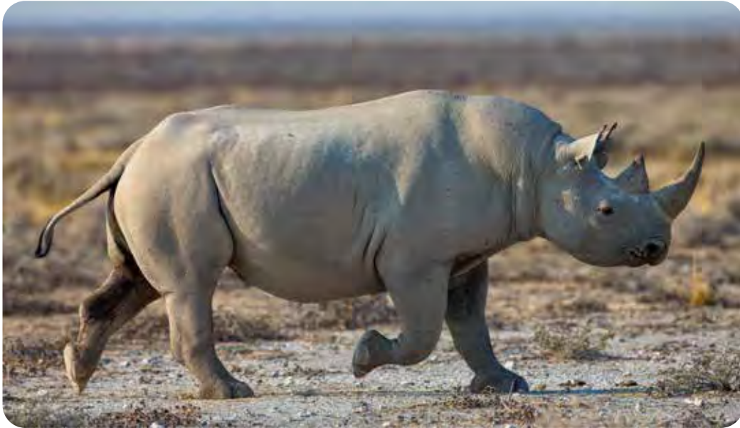
Black rhinoceros ( Diceros bicornis ).

The white rhinoceros Ceratotherium simum and black rhinoceros Diceros bicornis ranging in Africa are listed in Appendix I, except for the white rhinoceros populations of Eswatini and South Africa which are listed in Appendix II for trade of live animals and hunting trophies.