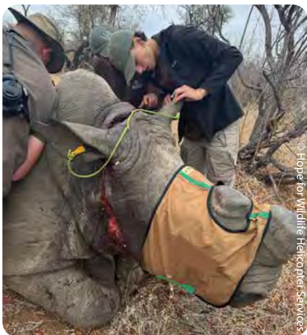
© Hope for Wildlife Helicopter Services