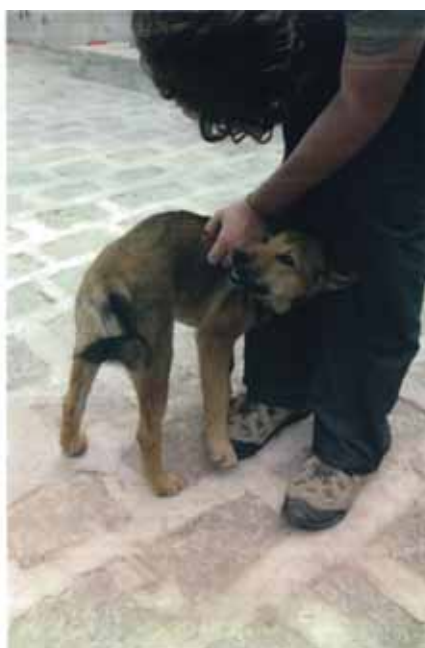
Fig. 3, 'Liu', Tràng An, Ninh Bình Province, Vietnam, 2009.