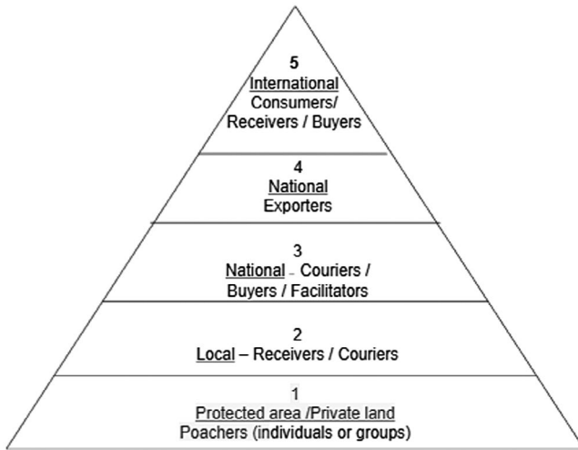
Five levels in the structure of organized crime groups involved in rhinoceros poaching and illegal rhinoceros horn trade in South Africa