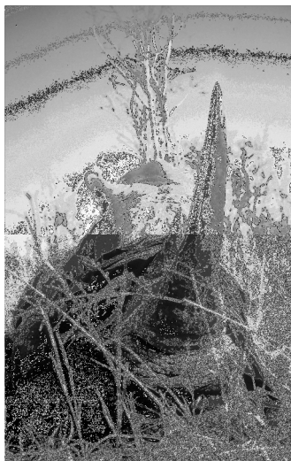
Immobilized white rhinoceros