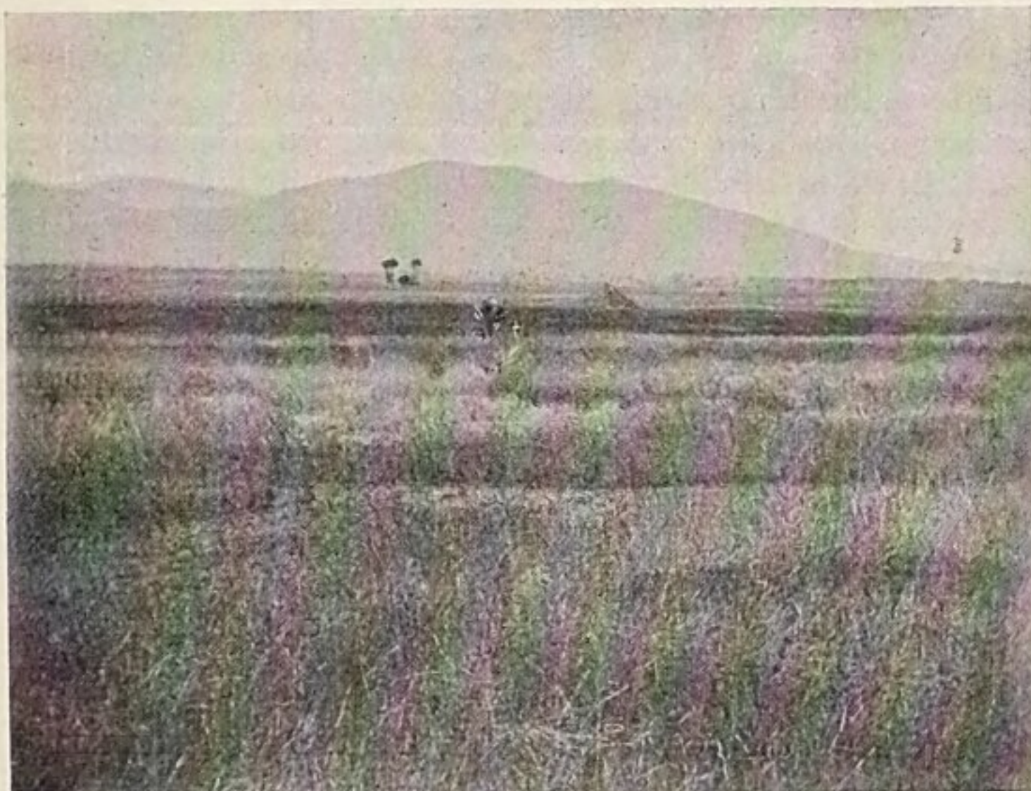
THE ELEPHANT MARSH

As to the Avi-fauna: it is a country singularly rich in bird life. Amongst the birds, however, occur the same curious gaps in the distribution of species and genera which are found to the south of the Zambezi and in East Africa but are wanting in this south-central part of the continent. The ostrich, and the secretary-vulture, three genera of true vultures, nearly all the genera and species of African larks and of bustards are represented in Africa south of the Zambezi, skip British Central Africa, and reappear again north of the Rufiji River extending thence northwards and westwards through East Africa, across the Sudan to Senegambia. There is a great paucity of species or genera amongst the guinea fowl; practically the only guinea fowl ordinarily found in British Central Africa is the common species, the origin of the domestic bird, though Guttera edouardi , the crested guinea fowl is met with near the Zambezi and on the Moçambique Coast. The sand grouse is only