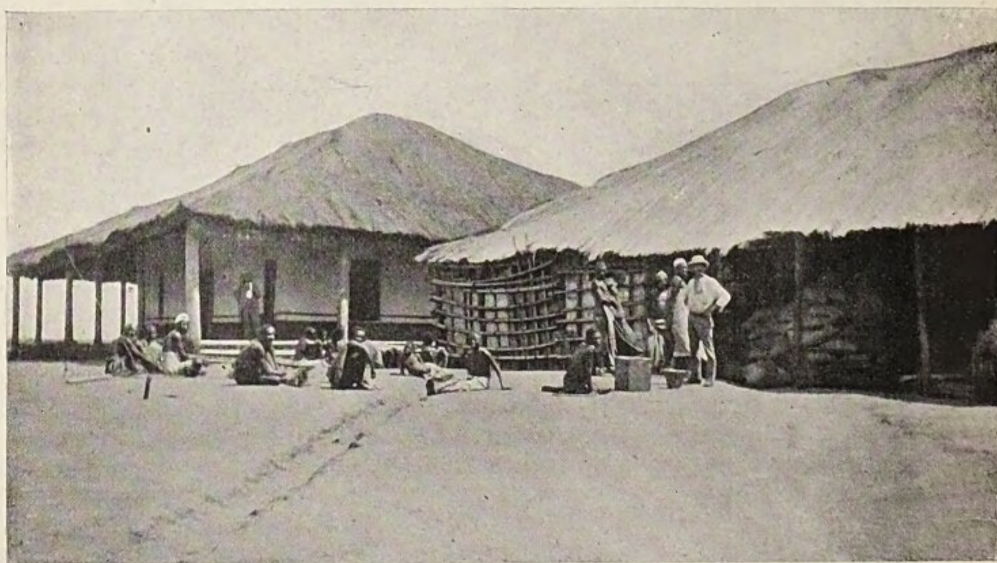
KAHN AND CO'S TRADING STORE AT KOTAKOTA

The trade products which British Central Africa gives us in exchange for these goods and for much English money in addition are: Ivory, coffee, hippo. teeth, rhinoceros horns, cattle, hides, wax, rubber, oil seeds, sanseviera fibre, tobacco, sugar (locally consumed), wheat (ditto), maize (ditto), sheep, goats and poultry (ditto), timber (ditto), and the Strophanthus drug.