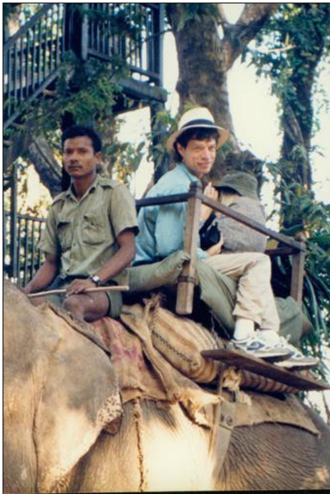
Mick Jagger at Tiger Tops in 1990