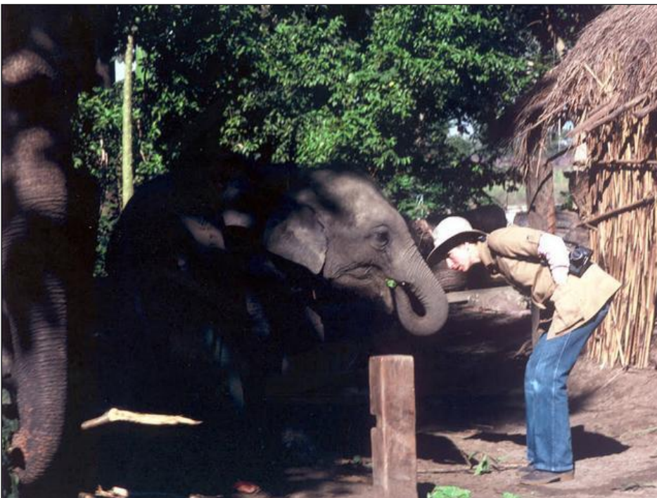
Princess Anne at the Tiger Tops elephant camp in 1981.