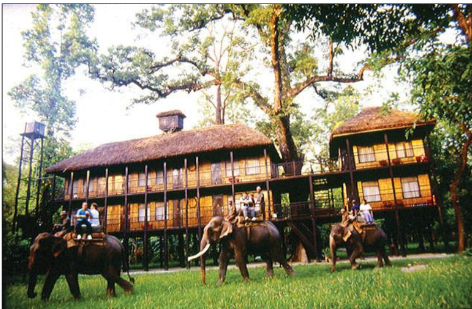
The Tiger Tops Jungle Lodge when it was still in operation and now (below)

The thick green forest is patterned with tangled creepers clasping tree trunks, crocodile bark and familiar wild animal scents. On our drive we pause as a rhino ( http://nepalitimes.com/article/Nepali-Times-Buzz/more-rhinos-means-more-encounter,4045 ) wades through a backwater, a startling pink-bottomed macaque faces off a rival, a cheetah barks in alarm, and a marsh mugger slides into the tal, hanging like a dream just beneath the cloudy green surface.