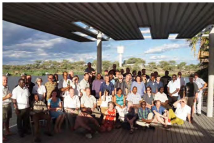
AfRSG members