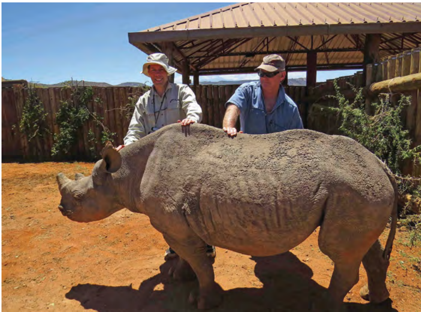
AfrSG SO and Chair with blind BR in Kenya