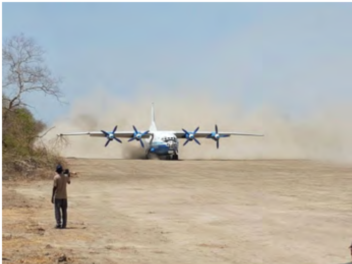
Rhino arrive Chad