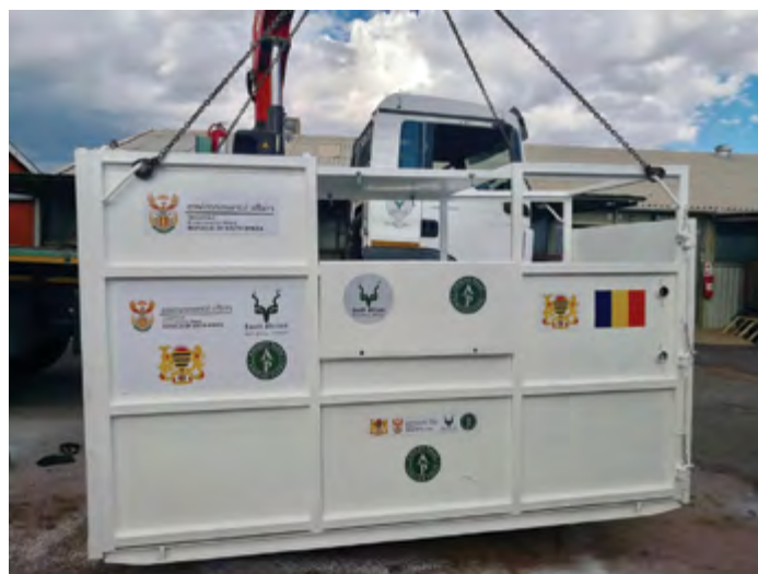
Zakouma rhino crate