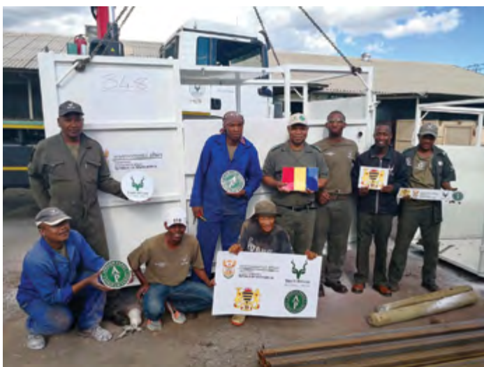
Crate building team