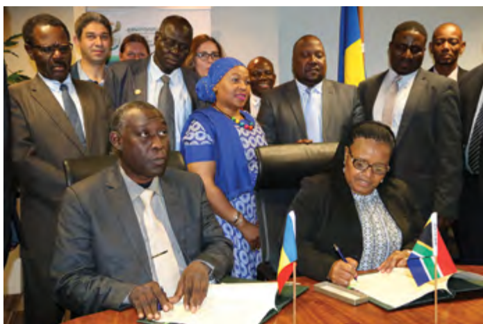
Chad S Africa agreement