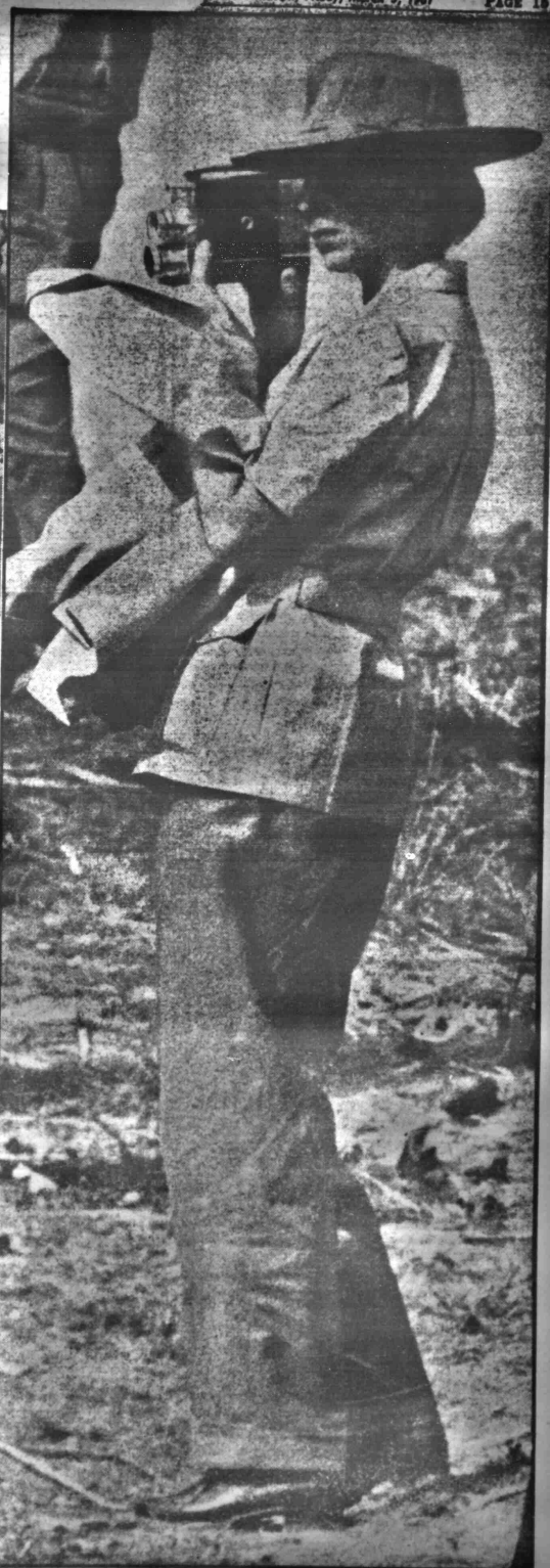
● ON TARGET . . . but the Queen shoots only with a movie camera. The Queen and the Duke are now in Teheran, guests of the Shah and Queen of Persia.