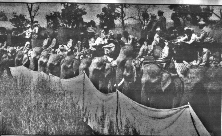
● TRAPPED . . . Part of the ring of 327 elephants, and the moveable canvas screens, which penned in the tigress (and rhino) shot by members of the royal hunting party in a jungle in Nepal last Monday.