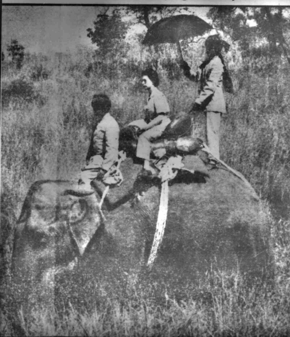
● RINGSIDE SEAT for the Queen, in slacks and bush shirt. An umbrella-boy is there to shade her bare head from the hot sun.