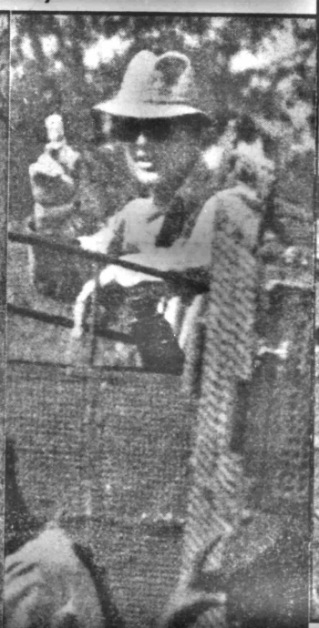
● SPECTATOR . . . The Duke looks on. His inflamed trigger finger stopped him shooting.