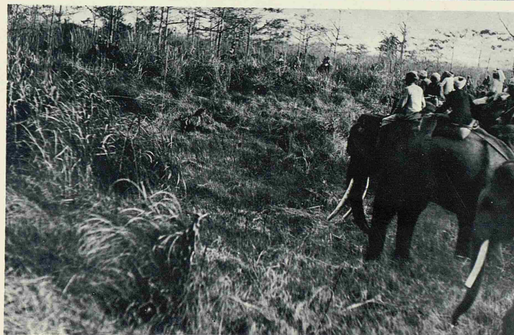
THE CIRCLE NARROWS and slowly but surely the tiger is brought to bay, the only hope being to make a dash for it past the converging elephants. A fine action

picture taken in the Nepalese Terai where some of the best sport in India is to be had. Only a short while ago the Viceroy and Vicereine were the guests of the Maharaja