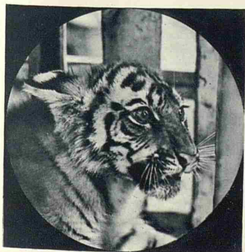
A CAPTURED TIGER CUB in the zoo at Katmandu where there are a number of fine specimens caught by Sir Joodha