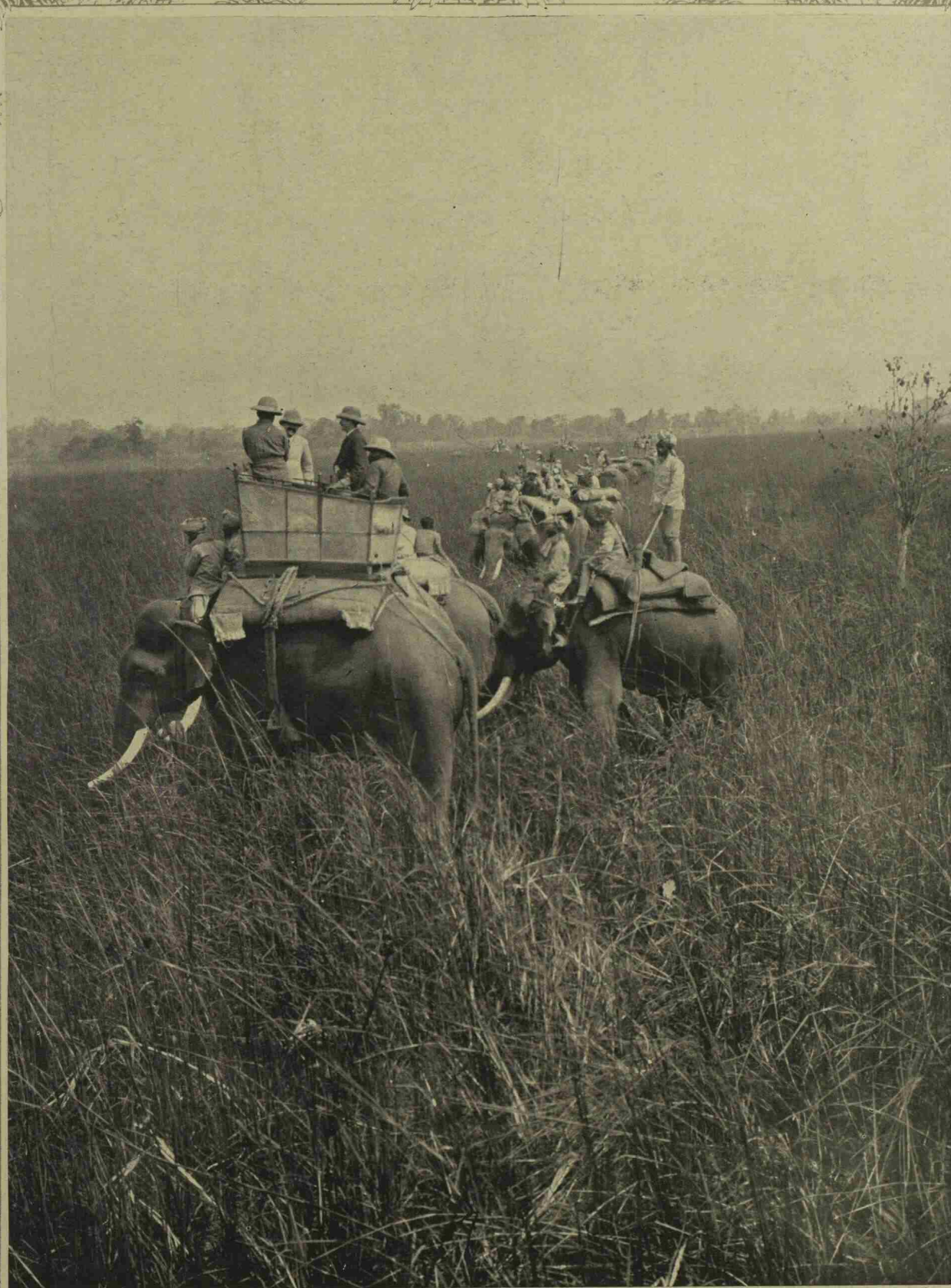
A RHINOCEROS HUNT IN FULL SWING: THE "GUNS" AND THE BEATERS AT WORK IN THE JUNGLE.

The official programme of the arrangements for the King-Emperor's visit to India set it out that his Imperial Majesty should have some big-game shooting in Nepal, where he arrived on December 18. Two shooting camps were specially arranged in the jungles, one at Sukimar, which is some thirty miles from the British frontier, and another at Kasra, seven miles from the first. The road to these camps, which is a clearing through the forest, was turned into a