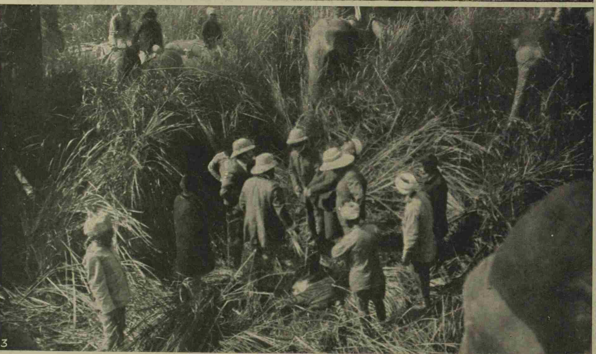
1. ON THE EDGE OF THE "RABBIT-RIDE," TRODDEN DOWN BY TWENTY OR THIRTY ELEPHANTS SPECIALLY EMPLOYED FOR THE PURPOSE: THE "GUNS" AWAITING A RHINOCEROS BY THE SIDE OF THE CLEARING.

(Continued.)—To quote Reuter: "Six hundred shooting-elephants have been collected, and the Nepalese shikaris are most skilful in finding the whereabouts of a tiger. The spot is then cleverly ringed by hundreds of elephants, which gradually converge, and the royal elephant is posted. A few of the best fighting-elephants then advance on the tiger and drive him out, in order that he may show himself to the King. . . . The usual method of shooting rhinoceros is for the