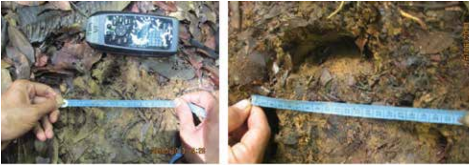
Figure 3. BBS RPU's documenting footprint of young rhinos.

elephant-human conflict, driving elephant herds out of villages and back into the forest.