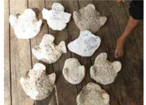
Figure 10. Javan rhino footprints from UKNP