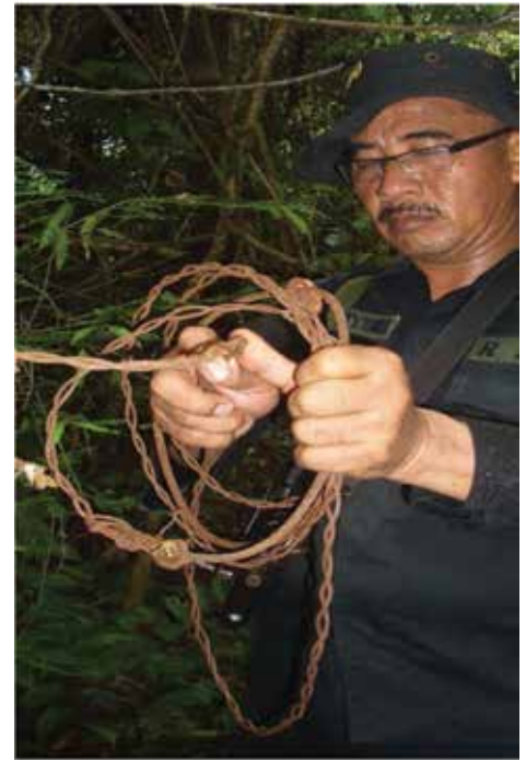
Figure 4. RPU's have more frequently discovered and destroyed heavy-cable snares that are routinely set for large mammals, including tigers and young rhinos.