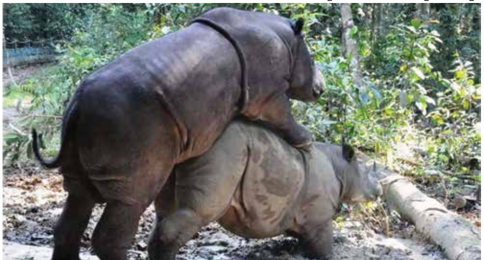
Figure 5. Rosa tolerating mounting

In late 2014, the US government approved an additional $ 11.2 million for conservation in Sumatra, to be administered through the Tropical Forest Conservation Act (TFCA) debt-for-nature swap mechanism. The objectives of this new funding are to continue and enhance the conservation of tropical forests, focusing