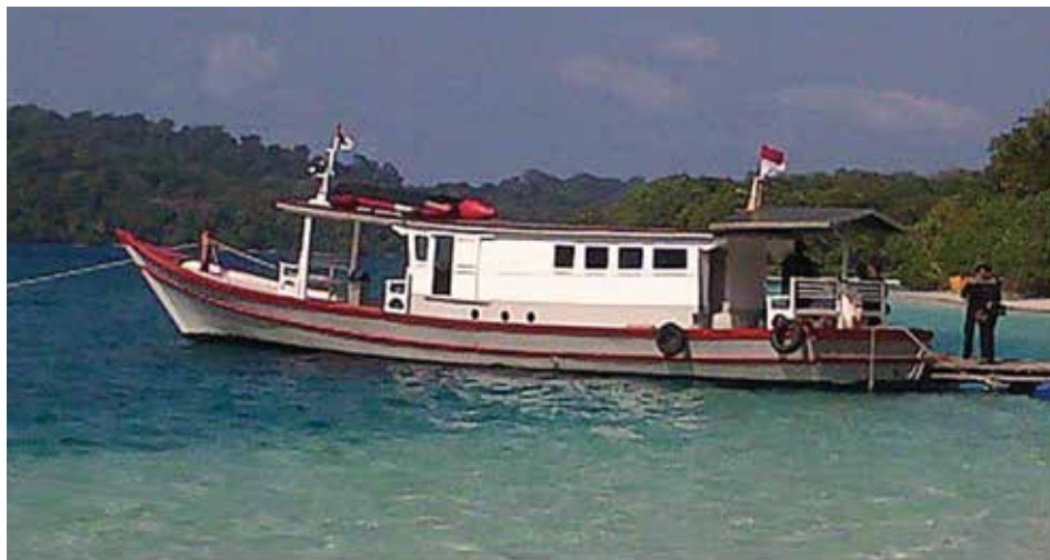
Figure 9. Patrol boat for RPUs working on the Ujung Kulon peninsula.

on key areas for Sumatran rhinos, tigers, and orangutans. Matching funds totaling $560,000 had to be raised by 30 September 2014 to secure this U.S. government funding, representing roughly a 1:20 return on match investments. Through the Asian Rhino Project, the Cincinnati Zoo & Botanical Gardens, and a private donor, the IRF raised $150,000 of this match.