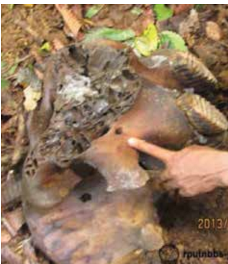
Figure 1. RPU points to bullet hole in the skull of a poached elephant