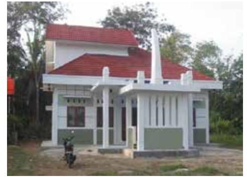
Figure 13. New RPU base camp

for the critically endangered Javan rhino. In 2011, analysis of video camera-trap images led to an estimate of 35-44 Javan rhinos remaining in Ujung Kulon. In 2013, IRF and WWF donated 140 additional camera traps to the park, which were deployed and led to an estimate of more than 50 individuals (33 males and 25 females). The UKNP camera trap data were validated by an independent group from the IUCN Asian Rhino Specialist Group in early 2014; this group agreed that there are between 58 and 61 animals in the park – good news from previous estimates based only on partial camera coverage (38 in 2011).