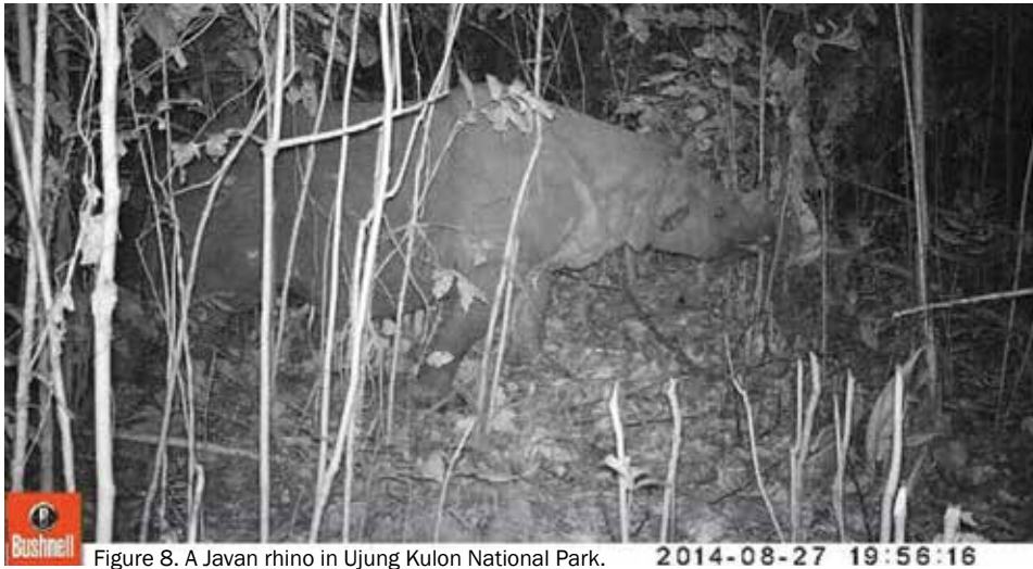
Figure 8. A Javan rhino in Ujung Kulon National Park.