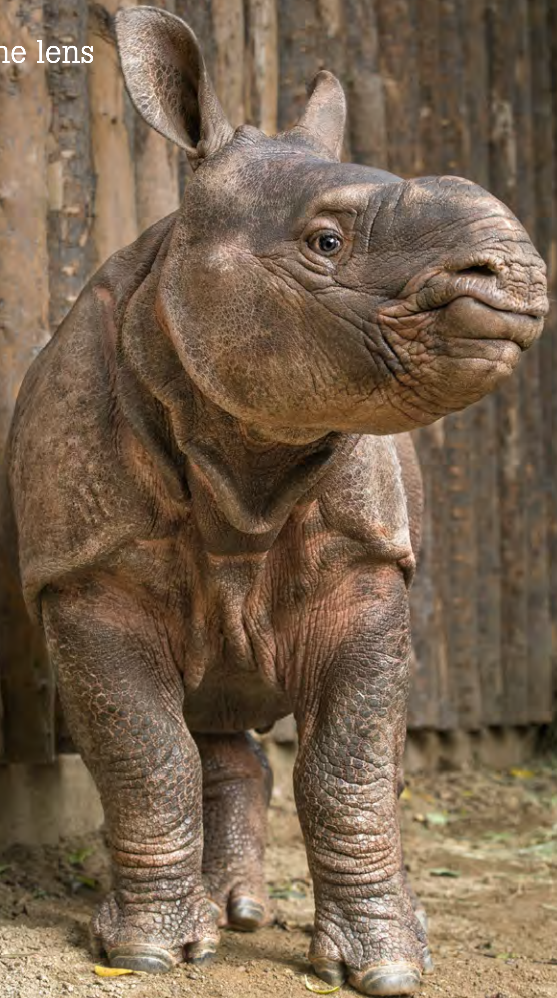
Greater one-horned rhinoceros calf Rhinoceros unicornus