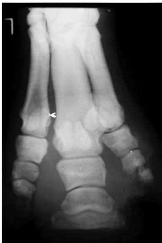
Figure 1. Radiograph of an eastern black rhinoceros with moderate to severe osteomyelitis of the left hind limb, third digit, second and third phalanges.

both hind limbs showed no evidence of osteomyelitis. However, the condition of the left hind lateral digit increased in severity with osteomyelitis seen by 7 mo, likely due to an increased stress load subsequent to lameness of the infected right foot. Additional antibiotics were administered (enrofloxacin 5.6 g p.o. s.i.d. for 60 days; Bayer Animal Health Care LLC, Shawnee Mission, Kansas 66201, USA) as well as continuing anti-inflammatory therapy (phenylbutazone 3,000 mg q 48 hr for 14 doses). The animal's lameness and infection of the digits continued to worsen. The nail of the left hind lateral digit sloughed associated with suppuration. Topical treatments such as flushing and scrubbing with chlorhexidine and betadine scrubs, as well as application of topical compounded dimethyl sulfoxide–furacin mixture and topical silver sulfadiazine cream (PAR Pharmaceutical, Inc., Spring Valley, New York 10977, USA), were initiated once a day. Medical treatments such as regional digital perfusion were