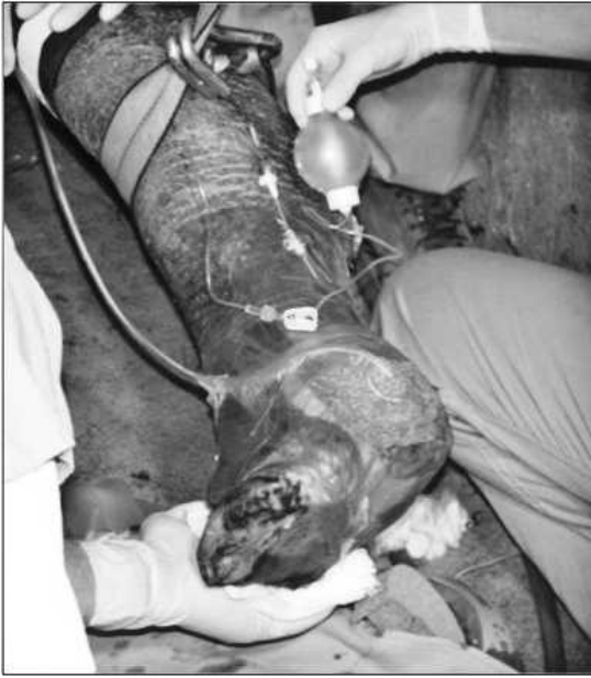
Figure 2. Application of a vacuum-assisted closure device on an amputated digit of an eastern black rhinoceros with an elastomeric pump for analgesia.

tubing was run through loops of 0 polydioxanone (Ethicon, Inc., Somerville, New Jersey, 08876, USA) sutured to the skin along the side of the rhinoceros. Anesthesia was then reversed and the pump maintained at -120 mm Hg intermittent suction. The V.A.C. therapy was monitored and remained in place for 72 hr, after which it was removed via operant conditioning. The wound appearance at this time revealed decreased exudation and the presence of early granulation tissue. Subsequently, the wound continued to heal by second intention.