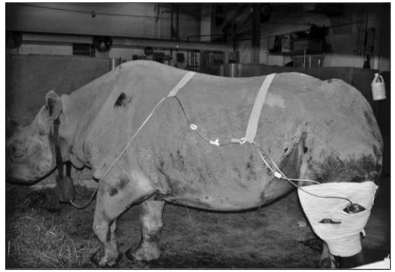
Figure 3. Eastern black rhinoceros with vacuum-assisted closure device applied to the left stifle. Devise was applied similar as described on the right side.

Thirteen months after the animal's initial presentation for lameness, the animal developed a 20-cm-diameter round ulceration on the lateral aspect of the right hind limb at the level of the stifle. Methicillin-resistant Staphylococcus aureus (MRSA) was cultured. A footbath protocol and mandatory use of latex gloves while treating this animal was instituted due to employee health concerns. Topical treatments including flushing with 0.05% chlorhexidine, scrubbing with 1% betadine solution, and application of silver sulfadiazine cream were not successful in reducing the size of the wound. After 22 days of topical management, it was elected to anesthetize this animal and apply the V.A.C. to the affected area to further treat the wound and decrease the employee health risks associated with wound treatment.