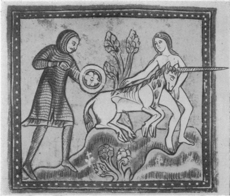
Fig. 2. Marginal illustration from Italian MSS. of 14th Century A.D. in the British Museum (Royal MS. 12.F.XIII folio 10v.)

chance finds, their origin obscured by successive exchanges, that were marketed by mediæval merchants—possibly in all good faith—as the authentic horn of the fabulous unicorn, and they were all the more valuable for being so scarce. Their scarcity can be judged by the fact that since their real origin became known in the 16th century, only three instances have been recorded of narwhals stranded on the coasts of Great Britain—in 1648, 1800 and 1808. There are also one or two records of tusks being picked up. The growth of the whaling industry however in the 19th century made them familiar objects.