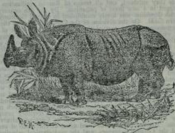
FIG. 1.—Indian Rhinoceros ( Rhinoceros unicornis ). This and the following illustrations are reduced from drawings by J. Wolf, from animals in the London Zoological Society's Gardens.

The first rhinoceros seen alive in Europe since the time when these animals, in common with nearly all the large remarkable beasts of both Africa and Asia, were exhibited in the Roman shows, was of this species. It was sent from India to Emmanuel, king of Portugal, in 1513; and from a sketch taken in Lisbon, Albert Dürer composed his celebrated but fanciful engraving, which was reproduced in so many old books on natural history. This species chiefly frequents swampy grass jungle and is fond of a mud-bath. According to General A. H. Kinloch, it is hunted by "tracking the animal on a single elephant until he is at last found in his lair, or perhaps standing quite unconscious