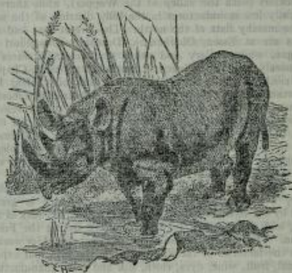
FIG. 3.—Black or common African Rhinoceros ( Rhinoceros (Diceros) bicornis ).

In the second section there is a well-developed nasal, and a small frontal horn separated by an interval. The skin is thrown into folds, but these are not strongly marked, and lower tusks are present. This group or genus is represented at the present day only by the Sumatran rhinoceros, Rhinoceros (Dicerorhinus) sumatrensis , with its sub-species. It is the smallest of all the species, and its geographical range is nearly the same as that of the Javan species, though not extending into Java; it has been found in Assam, Chittagong, Burma, the Malay Peninsula, Sumatra and Borneo. The colour varies from earthy brown to blackish, and the greater part of the body is thinly covered with hair, and the ears and tail are fringed. The average height of adults is from 4 ft. to 4 ft. 6 in. This species inhabits forests, and ascends hills to considerable elevations; it is shy and timid, but easily tamed even when adult. A specimen from Chittagong acquired in 1872 by the Zoological Society of London was named R. lasiotis , as it differed from the typical form by its larger size, paler and browner colour, smoother skin, longer, finer and redder hair, and the long fringe of hair on the ears. It is now recognized as a local race.