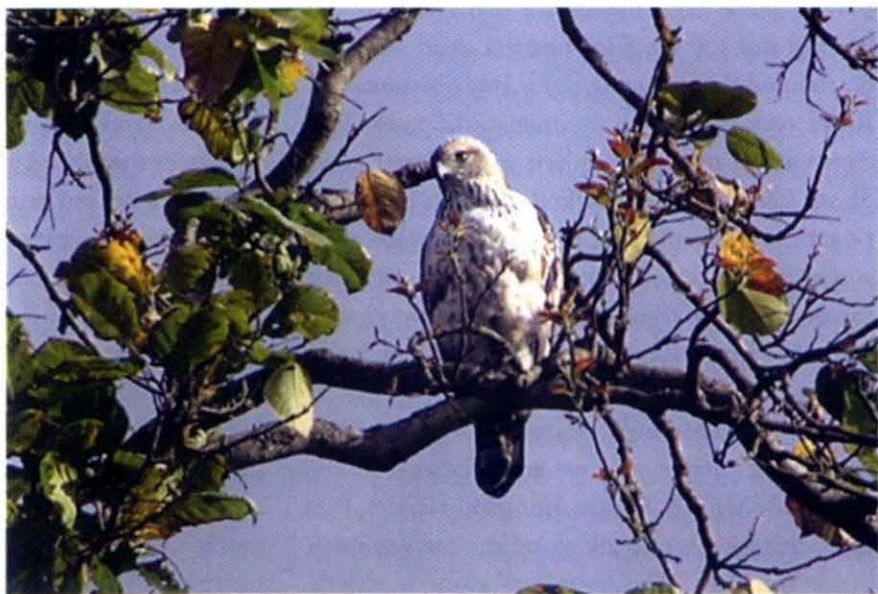
Short-toed eagle keeps watch for prey

The heavy nectar and pollen of the flowers on the trees attracts ants, bees and purple sunbirds, while redvented, blackheaded and redcheeked bulbuls visit the trees in abundance. And undoubtedly waiting to pounce on them is this short-toed eagle.