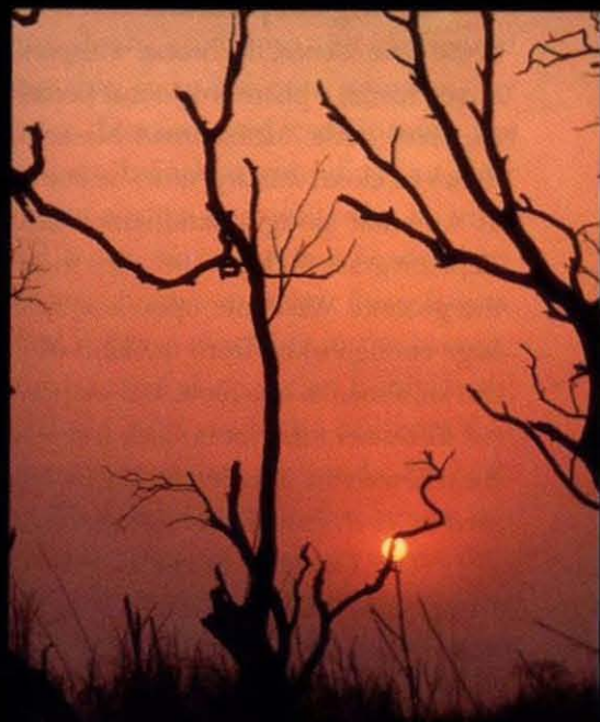
GAYATRI W. UGRA

Excess flood water remains stagnant in the taals of Dudhwa, killing much of the vegetation. Bare, leafless, dead trees stand stark against the bright sky. A member says "Isn't this a graveyard of trees!"