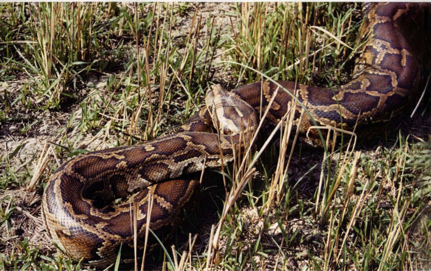
GAYATRI W. UGRA