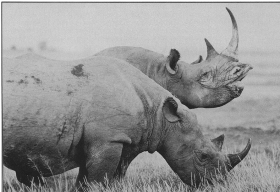
Under siege: In the past 10 years East Africa's black rhinos have been decimated.

The southern square-lipped white rhino ( Ceratotherium simum simum ) — which isn't white but grayish black — was considered one of the most seriously endangered animals 20 to 30 years ago. But under the protection of the Umfolowzi game preserve in Natal, South Africa, the