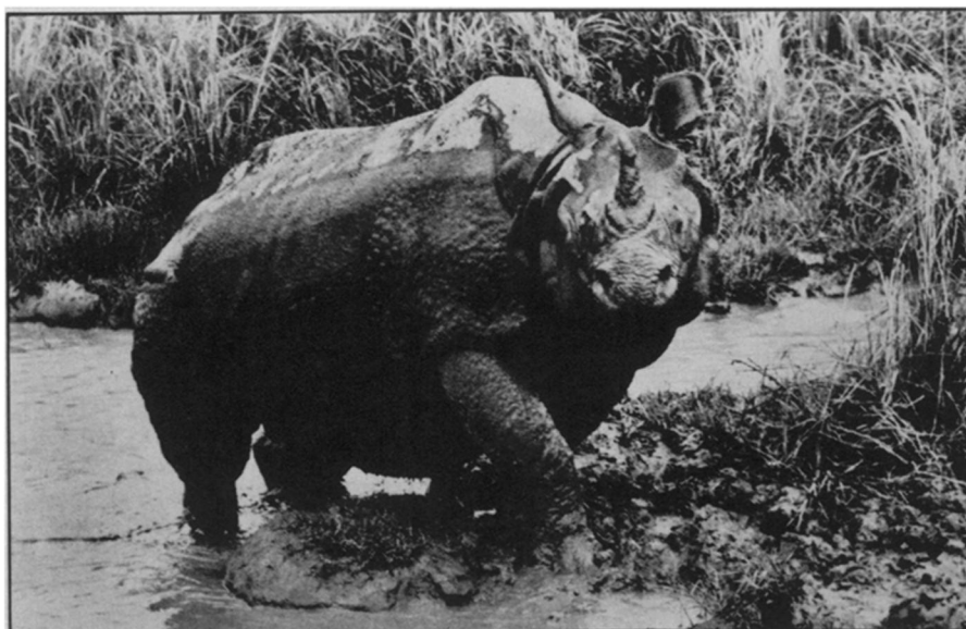
Rhinos, like this Indian photographed from elephant back, are swift but vulnerable.