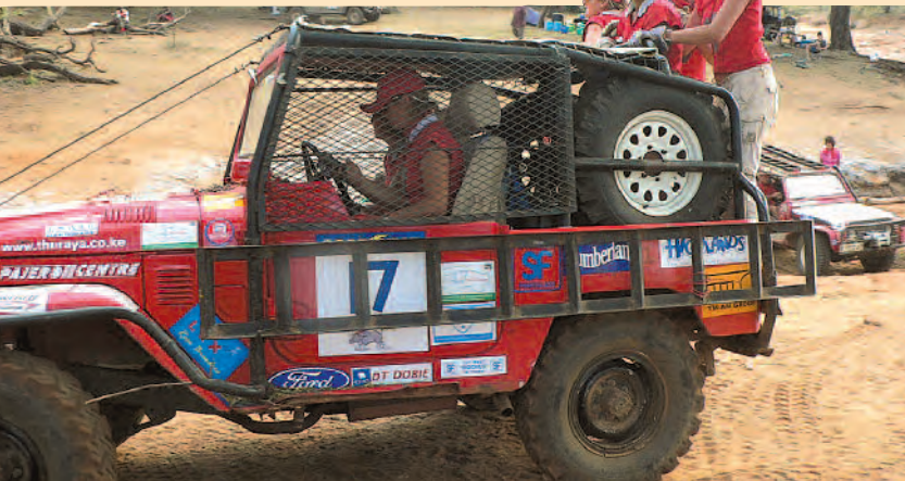
Girls beating the boys!