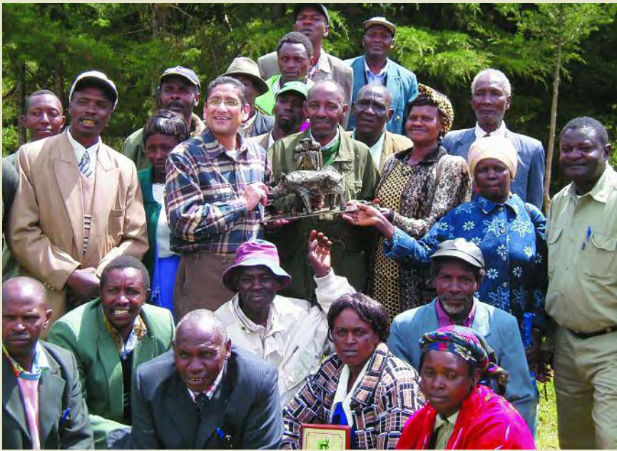
KEKIKI COMMUNITY won the 2006 East African Wildlife Society's Michael Werikhe Award for Conservation and Judged by the Rhino Charge committee.

The community bordering the Aberdares' Rhino Ark Phase Six fence project along Kereita, Kinari, Kamae (KEKIKI) in Kiambu District have embarked on an aggressive indigenous tree planting programme.