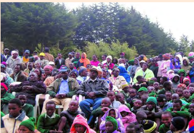
Several hundred fence line farmers attend ceremony.

He declared the project "has been widely accepted and is now owned by wananchi".