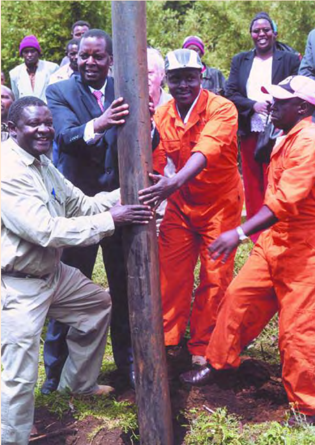
Finance Minister Amos Kimunya (second left) places final plastic post on Phase Six fence line.