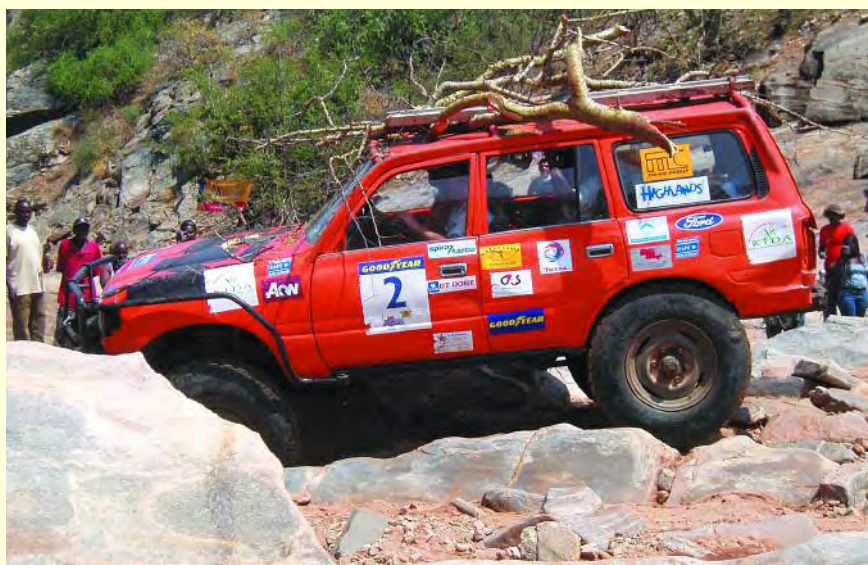
Winner Duncan's Toyota 'cruising' on big rocks