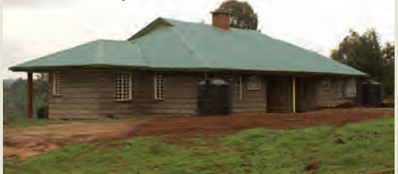
The recently completed guard post in Gakoe. Kengen donated Ksh 3 million to this guard post as part of the fence maintenance process.