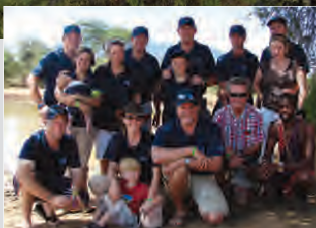
The team and families