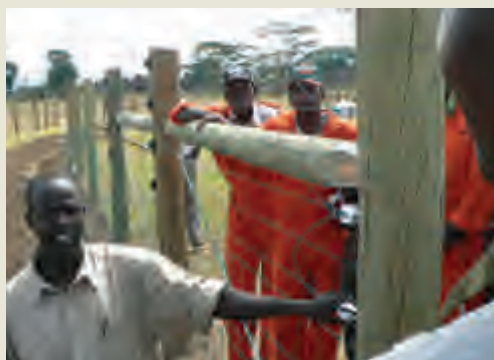
The first of a series of training workshops for fence scouts took place in June '08. By year-end over 80 scouts will have attended the workshops. The scouts walk the fence line daily. Resource support was provided by Gallagher Power Fencing Company.