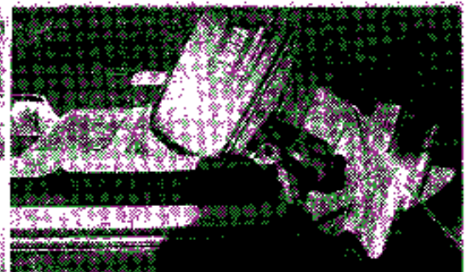
● One of SAVE's outboards at Matusadona, Lake Kariba.