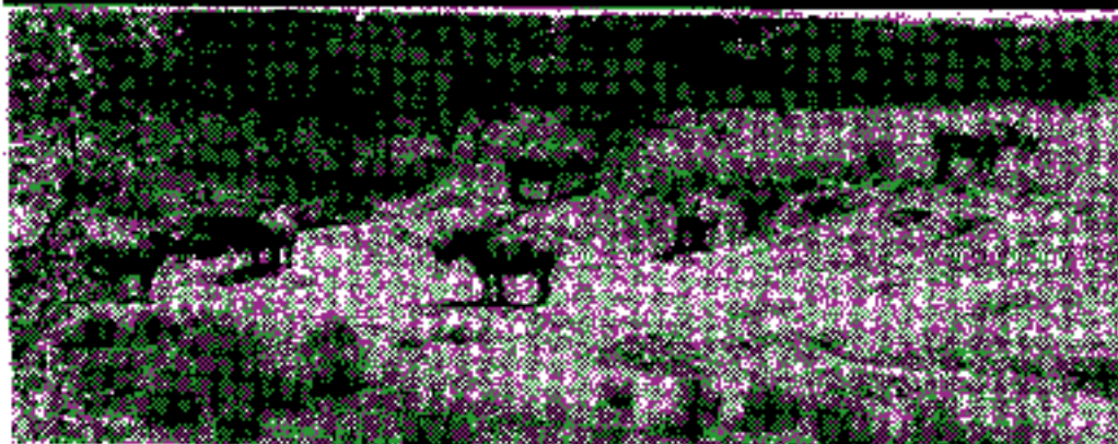
7 young rhinos in their natural habitat.