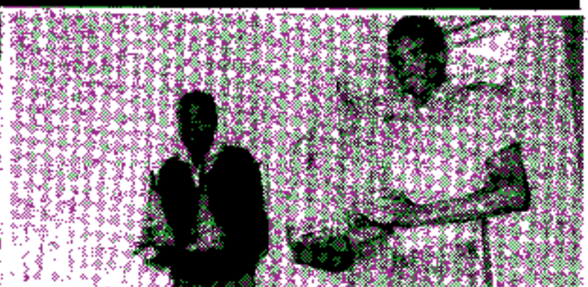
The tragic result of poaching at Chizarira.