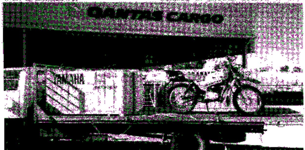
6 motorbikes bound for Zimbabwe.

Our fundraising in the past few months has been fairly minimal and is detailed in another section of this