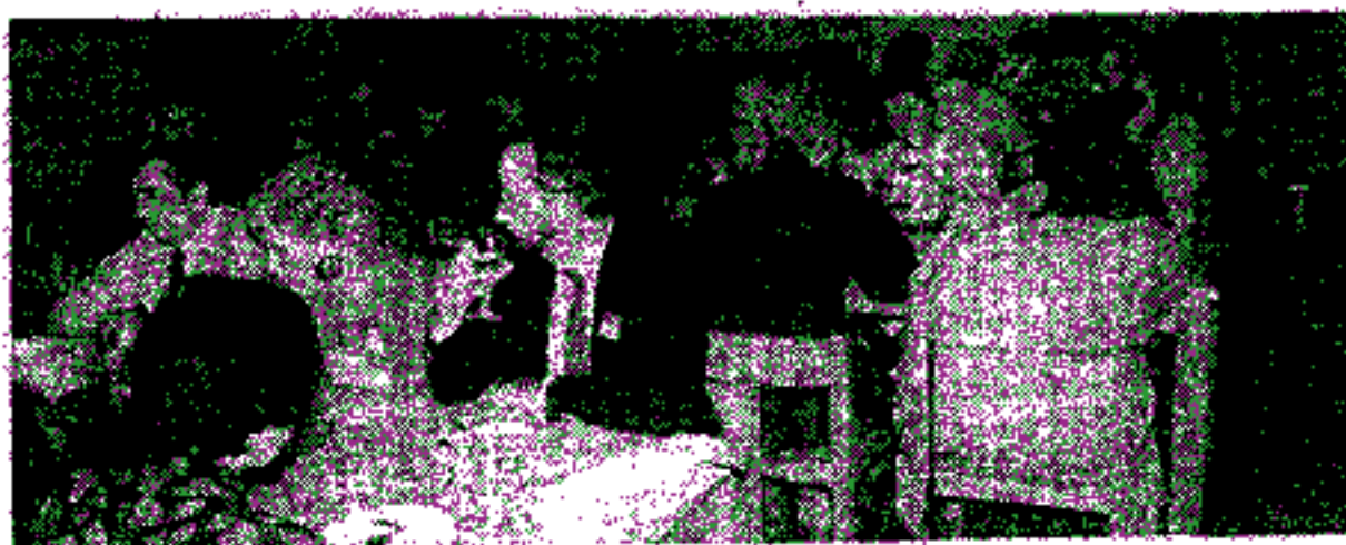
Dinner at Zebra's African Steakhouse.

varied items from Africa. We again thank all who attended the dinner for their support. To those people who took part in the Auction and were successful with their bids, we hope you are enjoying your purchases. We raised approximately $5000.