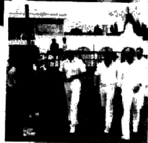
Greg Chappell, Mike Procter & Dennis Lillee leading out the World Invitation XI

World Invitation XI: 219: R Pienaar 85, G Chappell 44, D Gower 39, H Streak 4-14, M Jarvis 3-42, P Strang 2-36, J Traicos 1-34