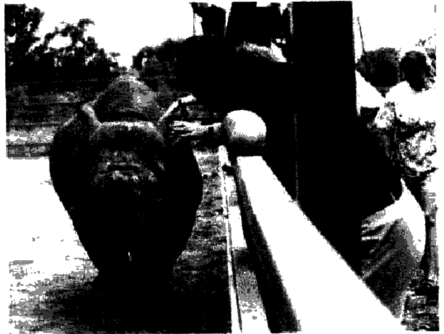
The Australian connection

The date for our AGM is Wednesday 21 June and it will take place at 15 Dendy Street, Brighton, and all members and their friends are