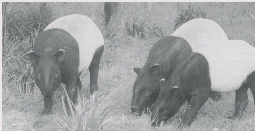
Malayan tapirs Lidana, Daeng and their calf Lidaeng at Port Lympne.

We lost two of the Lefini gorillas – a male, Kabo, died apparently from shock following injury in a fight, and a female, Loubomo, went missing after showing symptoms suggestive of concussion. An eight-month-old female arrived after being offered for sale to the wife of the French ambassador and subsequently confiscated by us. She was the only exception to the suspension of confiscations that we made last year in the light of the serious problem of overcrowding in the sanctuary. Because of the shortage of space for the various groups and the resulting aggression, we have