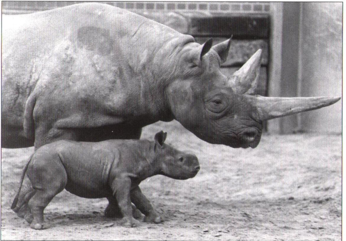
Black rhinoceros "Kilaguni" with 17 day old "Saba" born on 7 Feb 1991 in the Berlin Zoo

Next to the giant panda, the rhinoceros is seen today as a symbol and a flagship for the world-wide protection of endangered wildlife. After the catastrophic decimation of the black rhinoceros population in East Africa from many thousands to just a few hundreds between 1970 and 1993, the situation has become more stable since that time. Thanks to a consistent policy against international poaching and especially by translocating the majority of the available black rhinos from the large national parks into smaller conservation areas and private farms, the numbers in Kenya have grown to over 500 animals. In Zimbabwe, where about 300 animals still exist, a similar policy gives good hope that some increase can be expected. However,