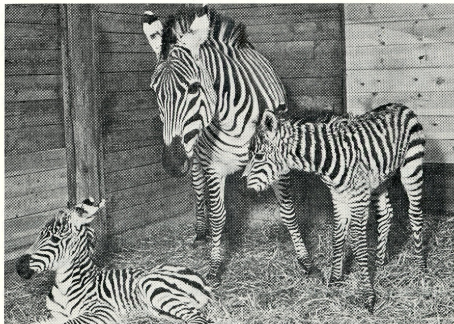
GRANT'S ZEBRA TWINS, BORN 13TH JANUARY 1968 AT THE COPENHAGEN ZOO.