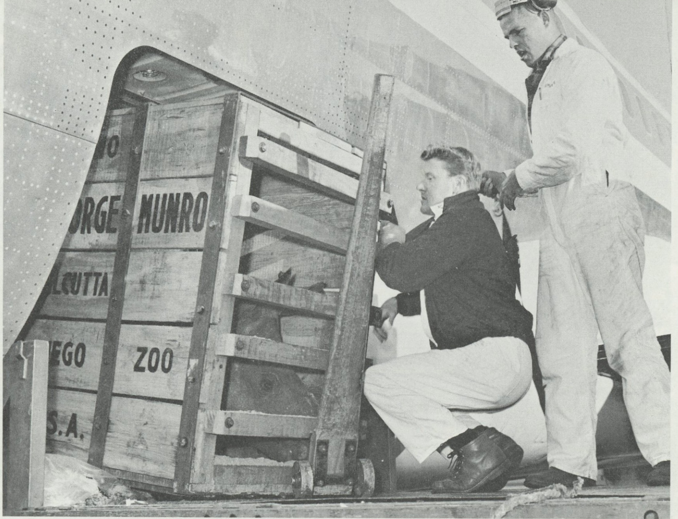
Almost two thousand pounds of baby animals were stowed among the cargo of a Pan-American passenger plane flying between Calcutta and Los Angeles. The rhino, weighing 1,111 pounds, was the first to be put aground, the crate clearing the hatch by mere inches.