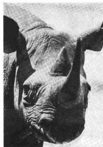
Taken with an Asahi Pentax Agfacolor 50 A.S.A. f.8 at 125th.

Application to mail at Second Class Postage rates pending at New York, N. Y. United States inquiries regarding subscriptions, news-stand sales and advertising to EASTERN NEWS DISTRIBUTORS INC., 255 SEVENTH AVENUE, NEW YORK 1, N.Y.