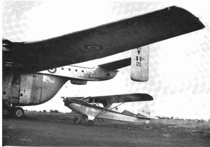
THE THREE-SEATER PIPER CRUISER, of the East African Wild Life Society, is dwarfed by the huge R.A.F. Beverley which carried it to Arabia to help rescue the oryx.