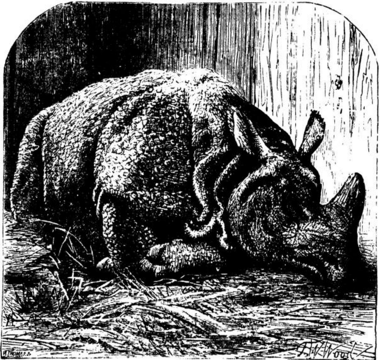
Great One-horned Rhinoceros.

birth, but estimates of the gestation period vary, from over to under a year.