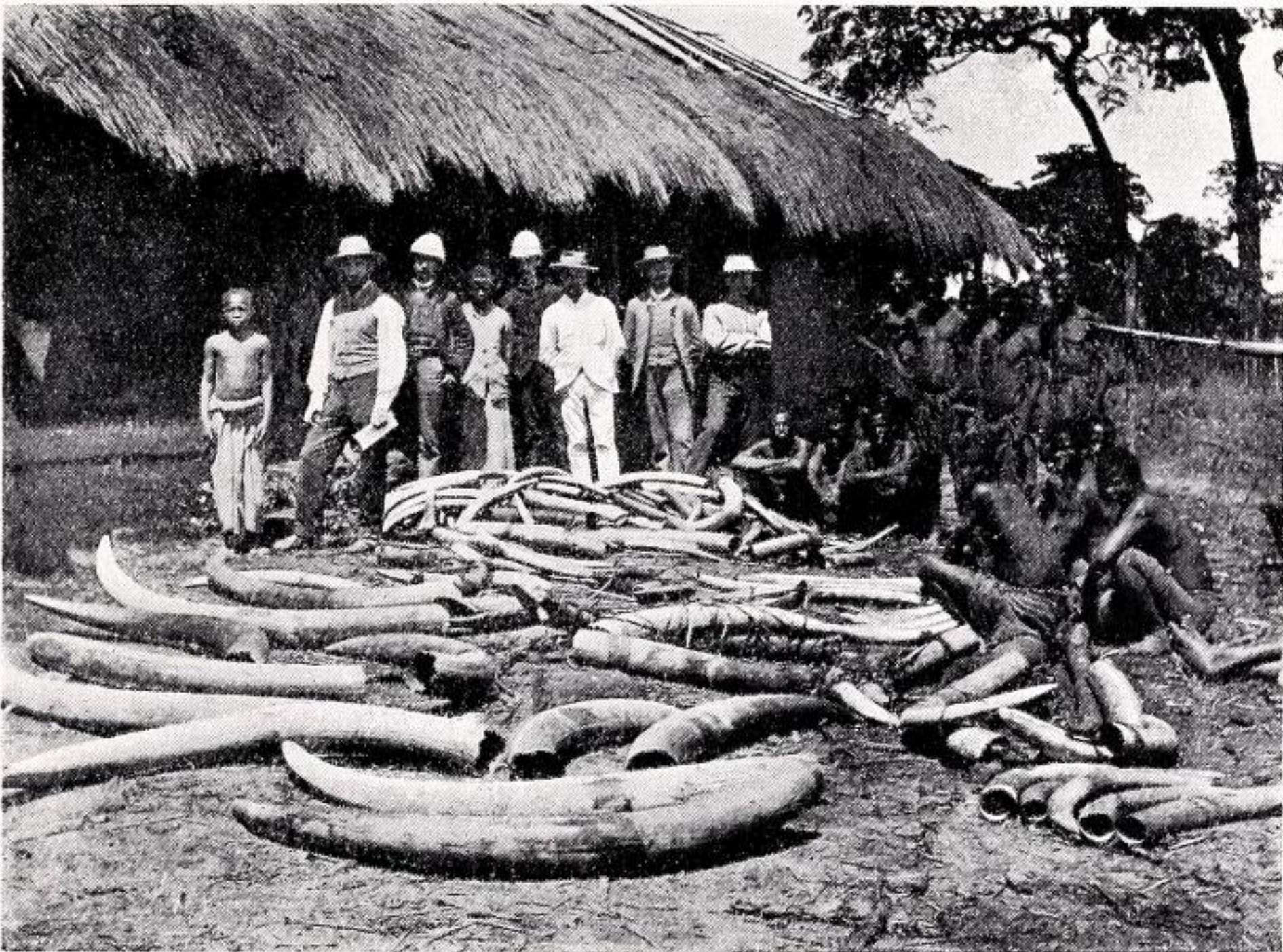
IVORY AT MANDALA STORE (AFRICAN LAKES COMPANY)

I do not suppose these words will have much effect on my readers.