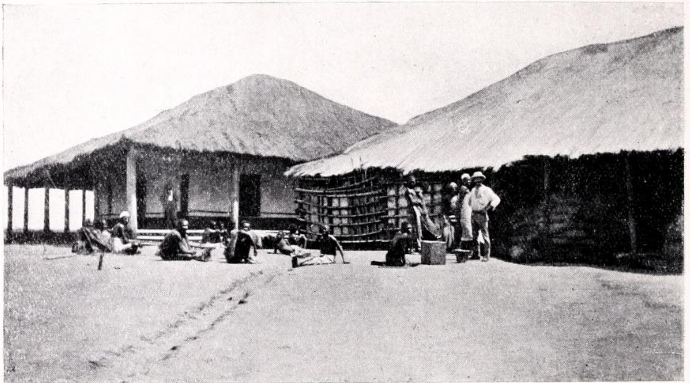
KAHN AND CO'S TRADING STORE AT KOTAKOTA

The trade products which British Central Africa gives us in exchange for these goods and for much English money in addition are: Ivory, coffee, hippo. teeth, rhinoceros horns, cattle, hides, wax, rubber, oil seeds, sansevieria fibre, tobacco, sugar (locally consumed), wheat (ditto), maize (ditto), sheep, goats and poultry (ditto), timber (ditto), and the Strophanthus drug.