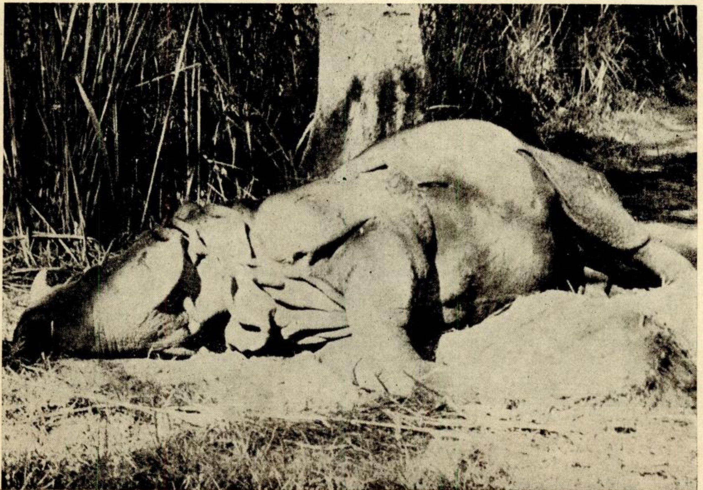
Fresh rhino kill by a poacher.