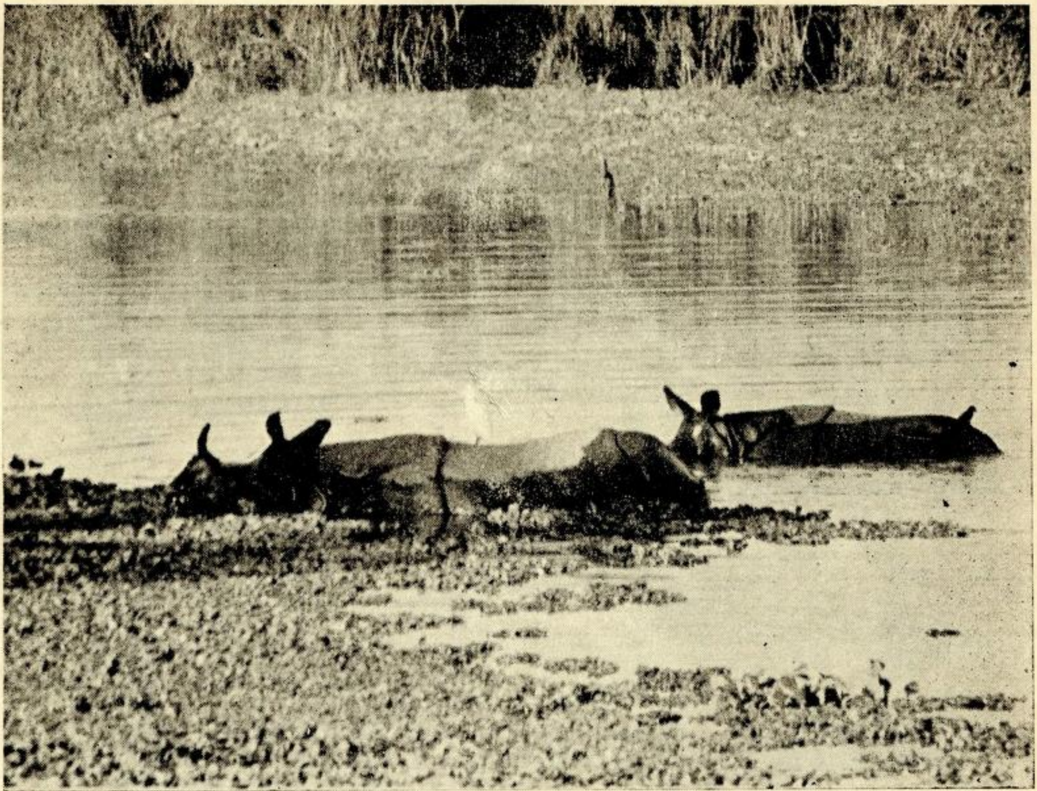
Mother and baby Rhino in the waterhole.