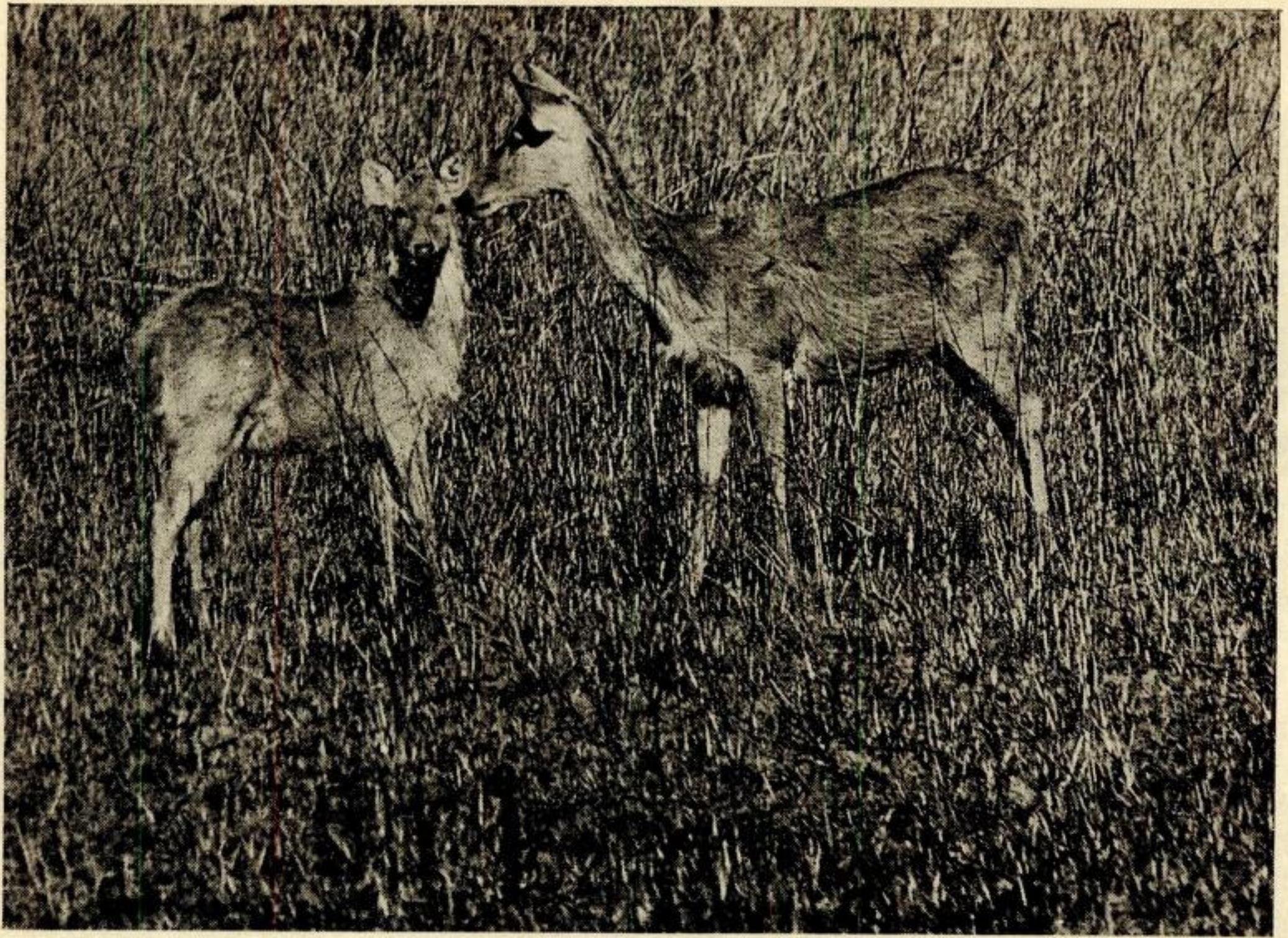
For India's threatened hardground barasingha "thou inheritor of unfulfilled renown"— fawn and going mother.