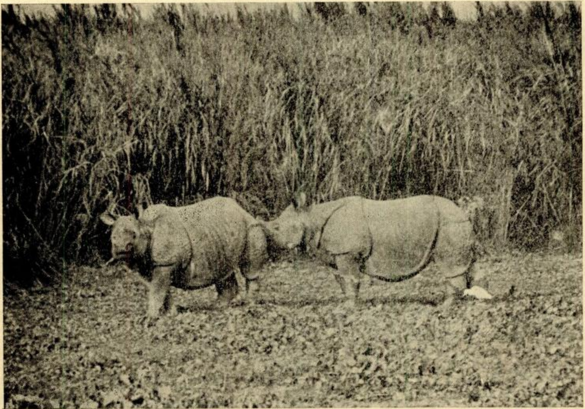
A rhino pair in Kaziranga.