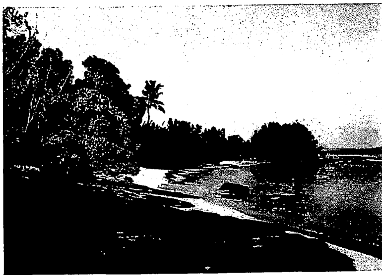
Niur Bay, one of the most beautiful localities of the reserve

now and again a specimen would stray near the town. But he recounts the remarkable story of a tame young rhino which, during a siege of the town, was driven out of the walls by his keepers before the gates were closed but walked back in again when peace was signed and the gates re-opened.