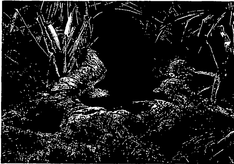
An exposed wallow in the outskirts of the Pandanus belt along the south coast