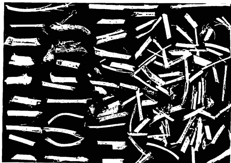
Old, dried-up dung balls and the remnants of small twigs, etc., separated from this dung. Such twig parts always lacked bark remains