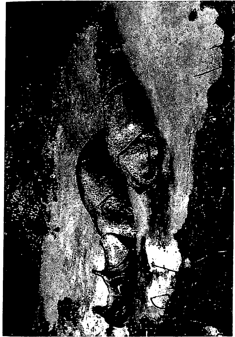
One of the first photo's taken from the blind pictured on Plate 19; both were bulls but symptoms of mutual intolerance were not noticed