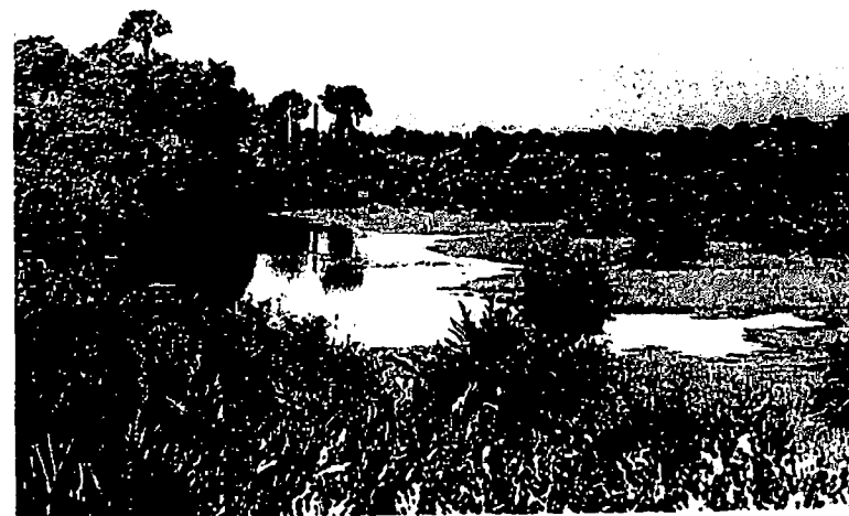
Acrostichum aureum in a brackish water marsh in the Tjitjangkok area