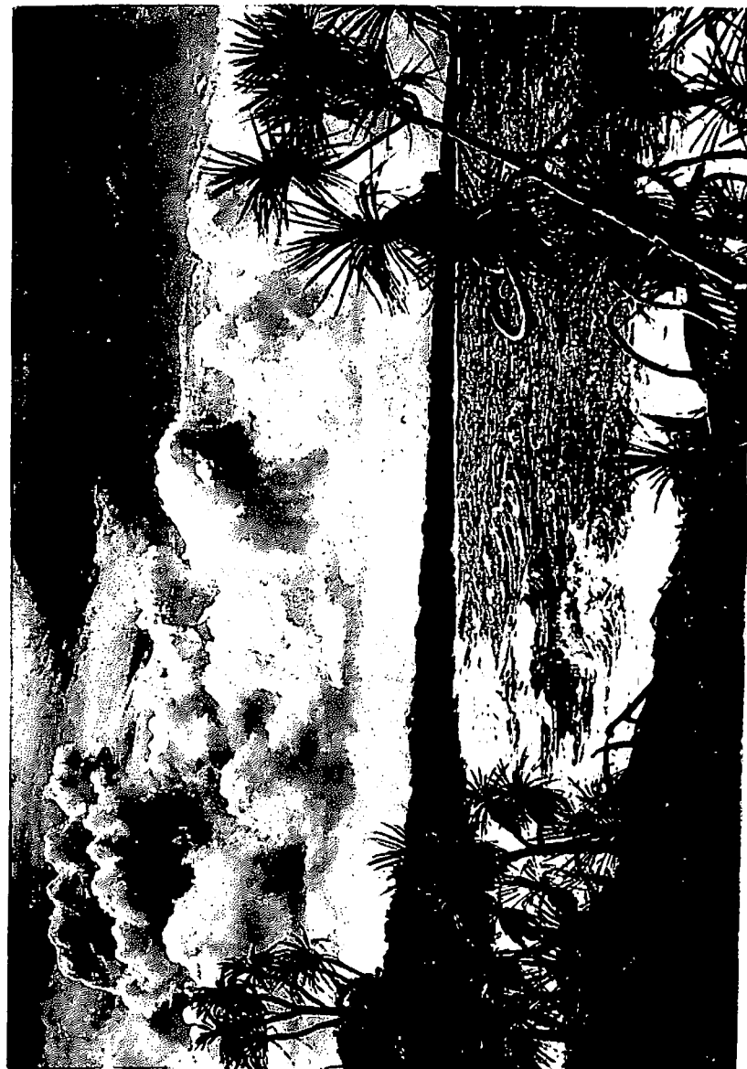
The south coast east of the Tjibunar

The sniffing was repeatedly noted as a loud "voo-voo" repeated several times; during an attack at night a loud snorting was heard, like "proose-proose", "hoocy-hoocy" or "shoo-shoo", very loud and threatening. In this case, too, the accompanying female emitted "mooing buffalo-like calls". During the daytime a charging rhino produced a "high-pitched sound" and a short "shof-shof", likewise audible over a considerable distance. In another case the loud sniffing of a charging bull was reproduced in the author's notes as an unnerving "hoosh-hoosh-hoosh". A rhino bull lying in a river was noted to emit a "high whistle", something like "poowet-poowet"; another rhino in similar circumstances was noted as uttering a "soft hiss", after which the animal rushed up the bank puffing and snorting. Because a whistling ("pfeifend") sound is also stated as originating