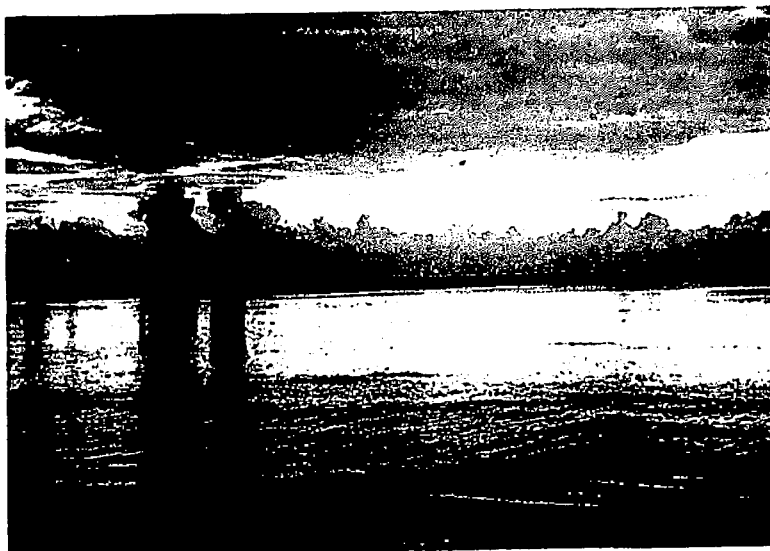
Sunset photographed from Tjikuja Bay; left Java's First Point, right Pulau Peutjang