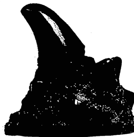
A poorly imitated rhino horn, clearly differing from a real one