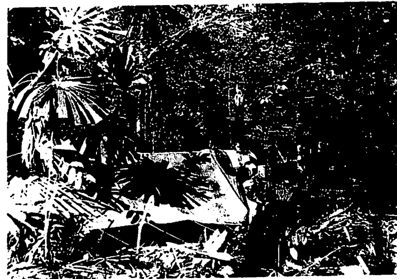
..... and almost without exception tents were the normal means of staying the night