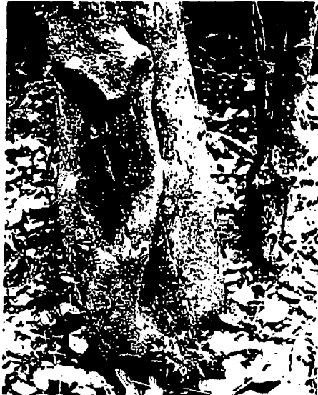
Heavily damaged and deformed rubbing tree near a wallow

Director there informs me that a 'heat' period has only once been detected in the female—on September 9, 1949—which lasted mildly for three days. The male and female at this zoo have to be kept separate, for on the three occasions on which they have been put together there has been a fight. If the Chicago Zoo authorities had hardened their hearts and persevered with the matter, their two rhino might have become reconciled to each other, as in the recent case of the pair of the Basle Zoo".