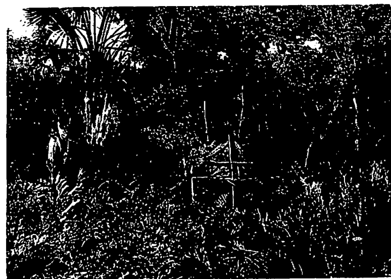
Observation hut in this swampfern-wilderness