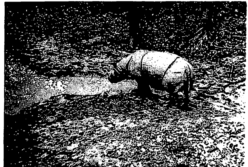
An hour later it was perhaps one of these rhino that returned, crossing the author's track of barely fifteen minutes before