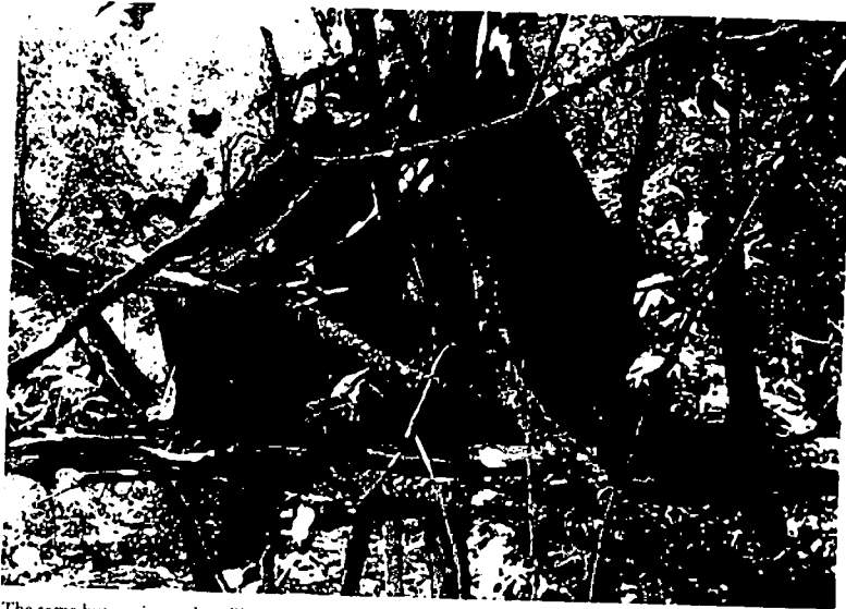
The same hut as pictured on Plate 18 in the the Niur region; from this site most rhino pictures were taken