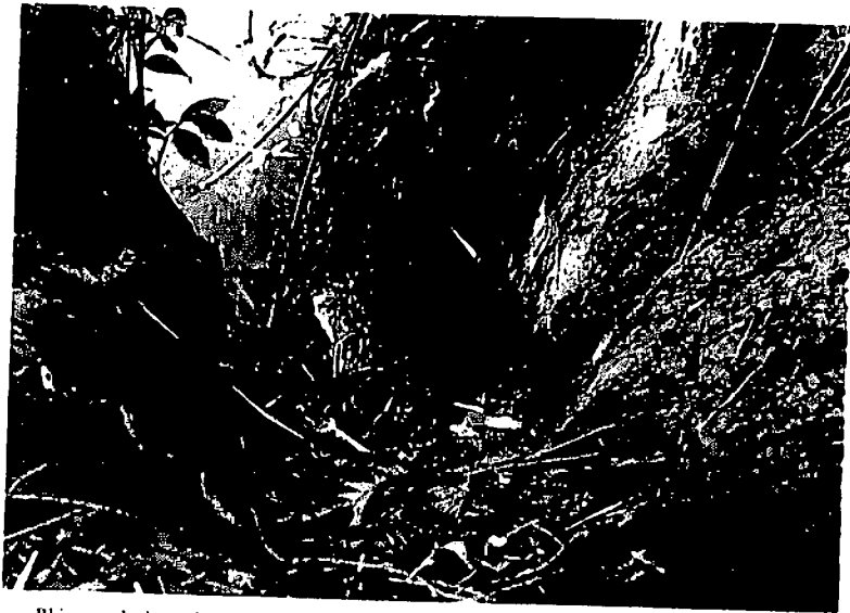
Rhino track along the Tjigenter, presumably used by many generations of these pachyderms