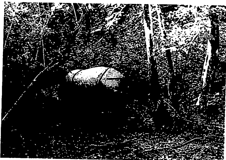
The usual retreat to a safer refuge when the sun rises