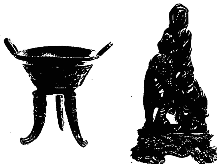
Some objects of art, carved from rhino horns, are the results of skilled craftsmanship in Old China; after Casal, 1938