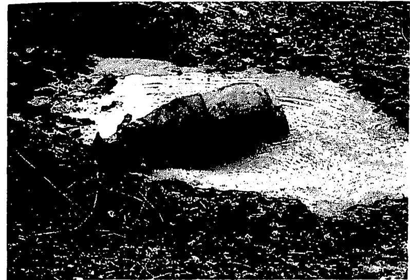
After the first bull had left (Plate 25), the second one crept back into the mud and retired about a quarter of an hour later. The shallowness of the wallow is evident