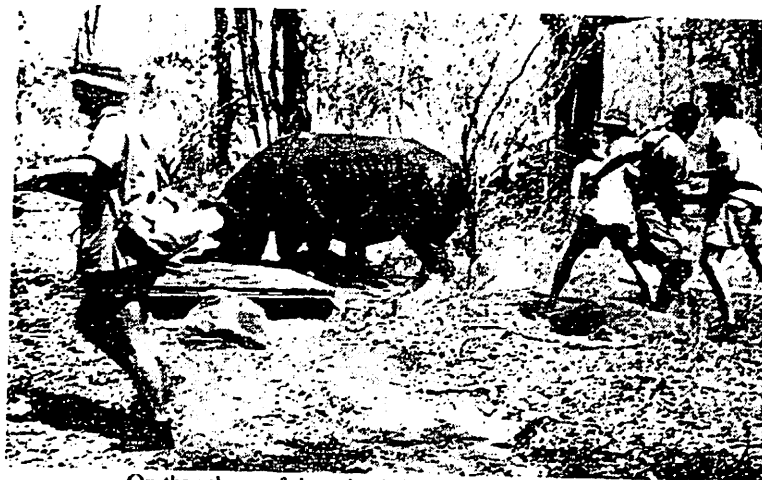
On the release of the animal the rescuers dash for safety.

Releasing the huge animal on the mainland after her rescue was fraught with almost equal danger, as she immediately turned on her rescuers.