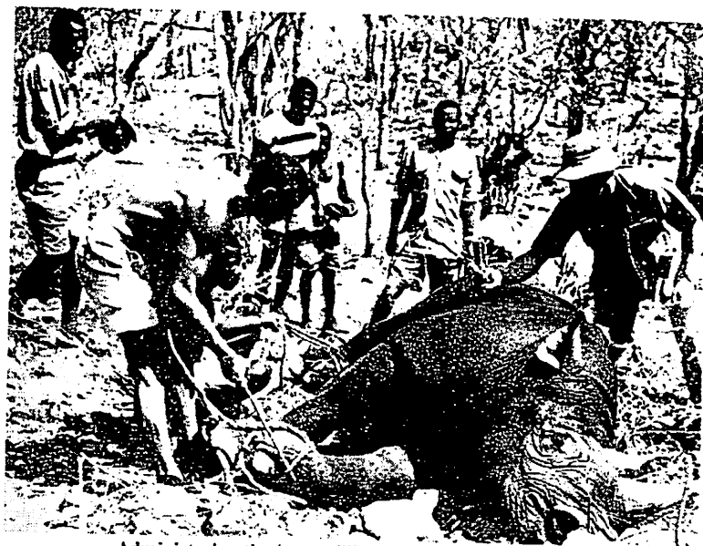
Administering the 'tranquillizer' to the captured animal.

The capture and securing of a solitary rhinoceros, on one of the islands being rapidly inundated, proved an extremely dangerous operation.