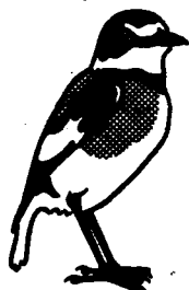
Laniocurdus torquatus Drosselwürger