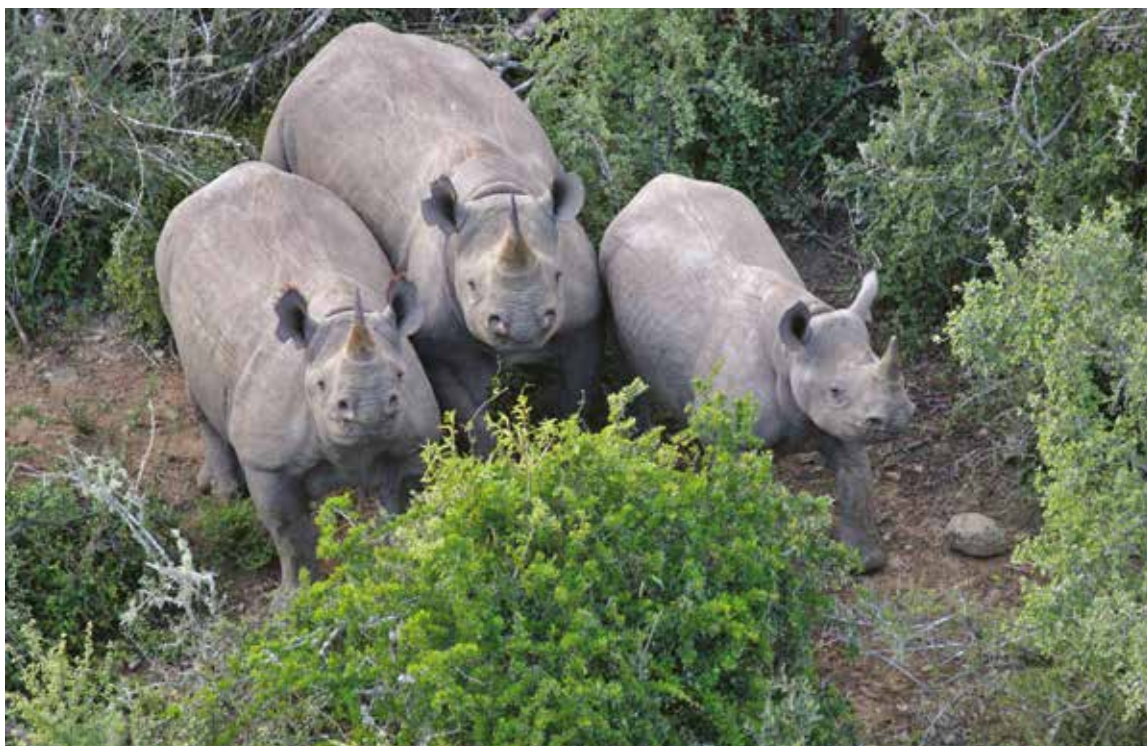
Black Rhino ( Diceros bicornis ) in the thicket