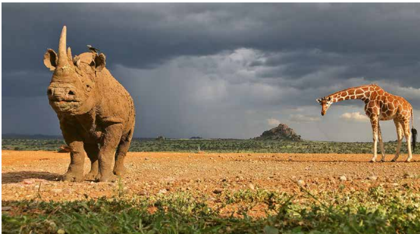
Black Rhino ( Diceros bicornis)

T-033 Fund the AfRSG secretariat to deliver on core activities through to the end of 2024.