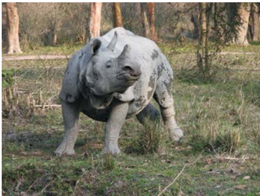
Greater One-horned Rhino ( Rhinoceros unicornis ) in Pobitora WLS