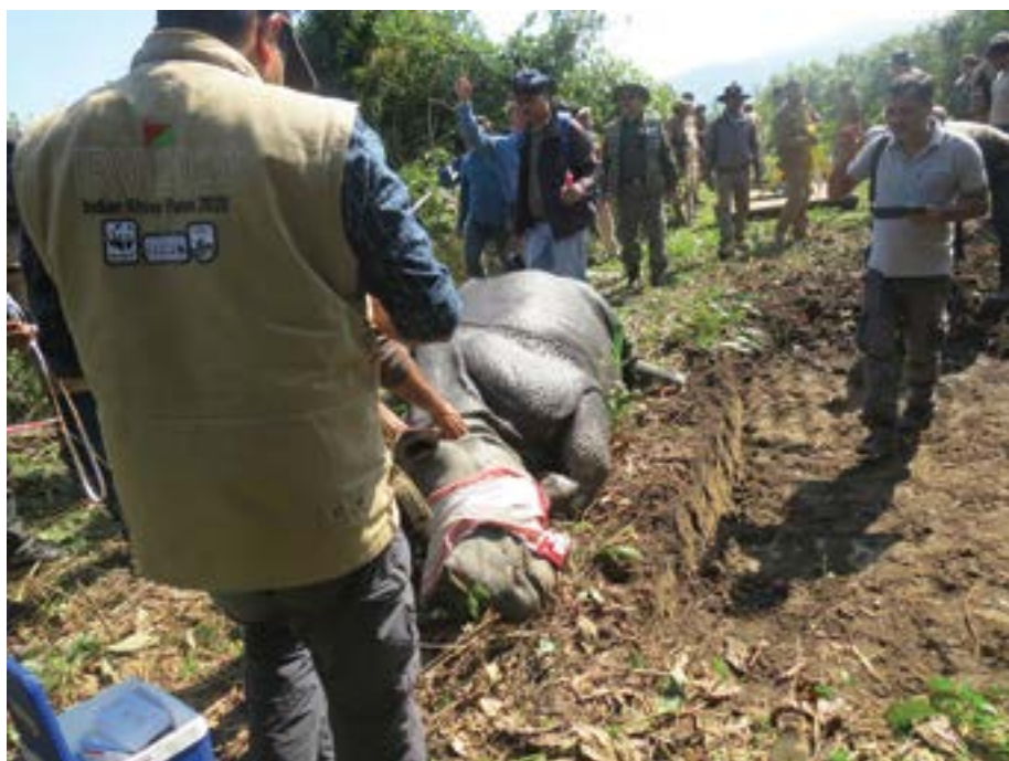
Greater One-horned Rhino ( Rhinoceros unicornis ) in Kaziranga for Translocation