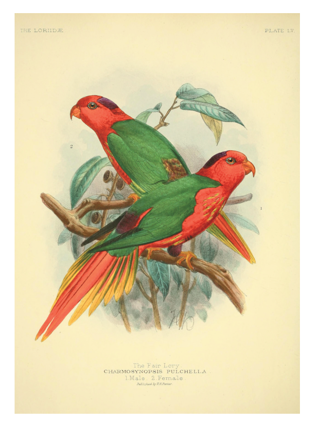
Figure 2. "The Fair Lory. Charmosynopsis pulchella. 1. Male. 2. Female. Published by R.H. Foster." Plate LV in the 'Monograph of the Lories' by St.George Jackson Mivart (1827–1900). The drawing is attributed to John Gerrard Keulemans (1842–1912).

The first description of Charmosyna pulchella by Gray (1859a) was based on two syntypes from Dorey collected by A.R. Wallace, registered as NHMUK 1859.4.8.41-42 (Warren 1966: 235). Rosenberg never cited the description by Gray (1859a) but stressed that these new species were discovered by both Wallace and himself. However, his publications appeared too late to show that he was among the first ornithologists to recognize this new species (Schlegel 1864: 130). The Charmosyna pectoralis Rosenberg, 1862 is considered a junior synonym of the Fairy Lorikeet, Charmosynopsis pulchella (G.R. Gray, 1859).