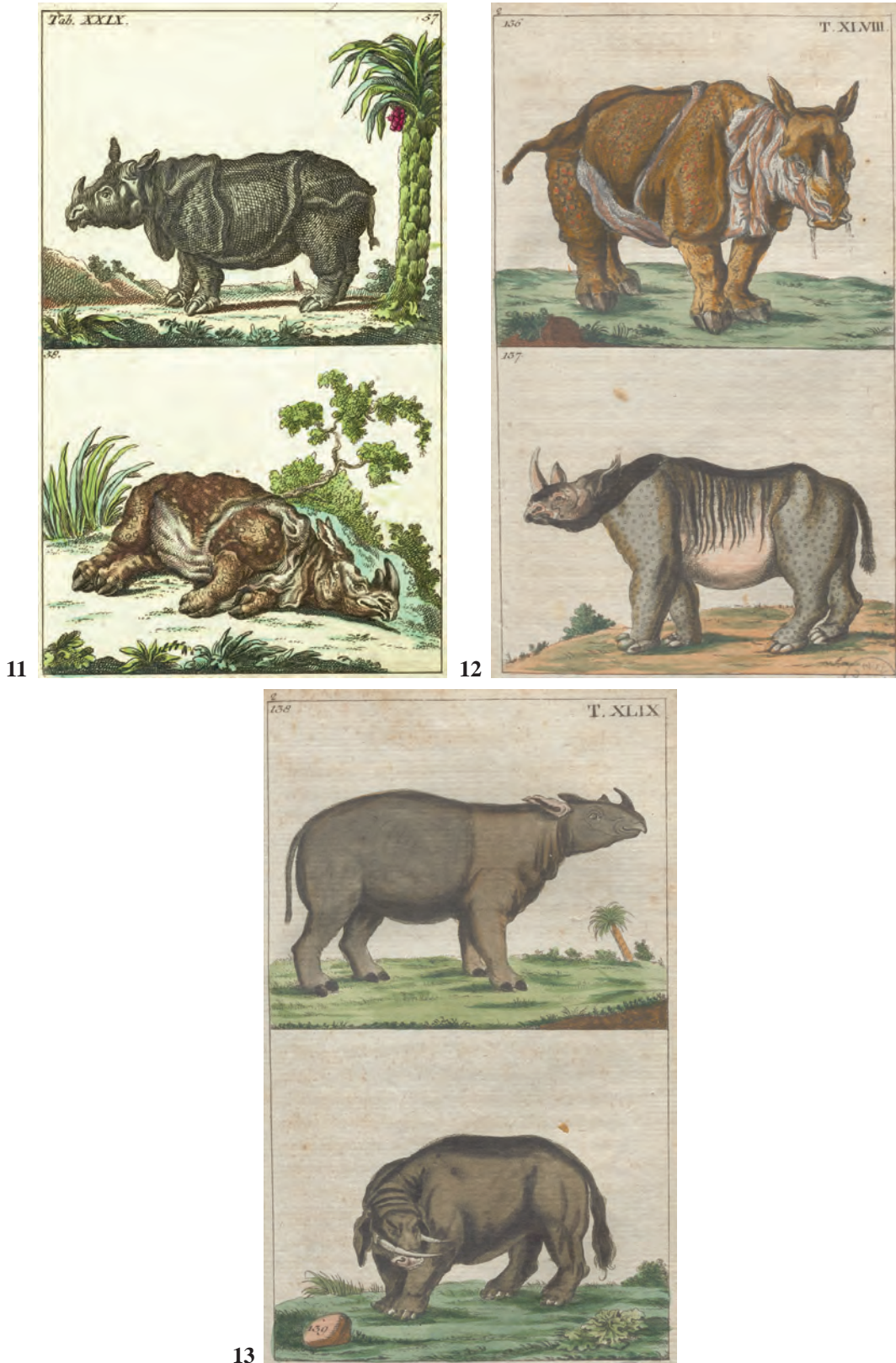
Figures 11–13. 11. Plate accompanying the text by Gottlieb Tobias Wilhelm in the first edition of the “Unterhaltungen aus der Naturgeschichte” (1792, pl. XXIX). The upper figure is the one-horned rhinoceros copied from Buffon (see Fig. 6), and the lower figure is the African double-horned rhinoceros copied (in reverse) from the “Geschilderte Thier-Reich” of 1768, where an additional posterior horn was added to a drawing of the Dutch Rhinoceros seen in Augsburg by Johann Elias Ridinger. 12. G. T. Wilhelm described three species of rhinoceros in the second edition of his “Unterhaltungen aus der Naturgeschichte” of 1808. Plate XLVIII depicted the one-horned rhinoceros after an engraving by Johann Elias Ridinger, and the double-horned rhinoceros after Sparrman (see Fig. 5). 13. The third species of rhinoceros described by G. T. Wilhelm in 1808 was the Sumatran species. The upper figure of Plate XLIX was based on the original of William Bell (see Fig. 1). The lower figure is a horned or tusked animal called Sukotyro.