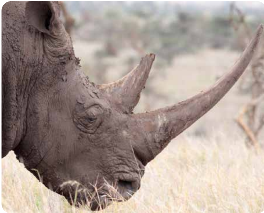
Southern white rhinoceros ( Ceratotherium simum ssp. simum ).

The white rhinoceros Ceratotherium simum and black rhinoceros Diceros bicornis ranging in Africa are listed in Appendix I, except for the white rhinoceros populations of Eswatini and South Africa which are listed in Appendix II for trade of live animals and hunting trophies.