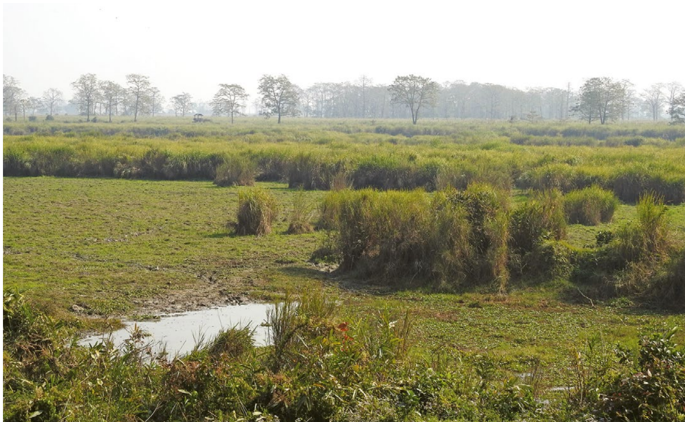
Typical alluvial flood plain grassland used by Greater One-horned Rhino ( Rhinoceros unicornis )

Sumatran Rhino populations in the wild, then consolidate them into a sanctuary for breeding purposes as a part of the national breeding programme, (2.2) support the movement of Sumatran Rhino amongst the breeding centres under the National Conservation Breeding Programme to optimise breeding opportunities, genetic diversity and population growth, (2.3) establish and operate the Javan Rhino Study and Conservation Area (JRSCA) Management System as a management centre for the Javan Rhinoceros population, (2.4) establish a second habitat and population of the Javan Rhino outside of the Ujung Kulon National Park, (2.5) encourage the exchange of rhinos between the populations of same species in order to improve the genetic health, (2.6) explore possibilities of expanding rhino ranges within the country or between rhino range countries for optimal population management, (2.7) sharing of technologies and scientific knowledge to restore the species and ecosystems, including Assisted Reproduction Technology (ART); (3) Habitat Management, (3.1) improve habitat management techniques in rhino bearing areas to maximise habitat suitability and expansion of its range, (3.2) develop and implement rhino habitat management guidelines to ensure continuous availability of food, water and