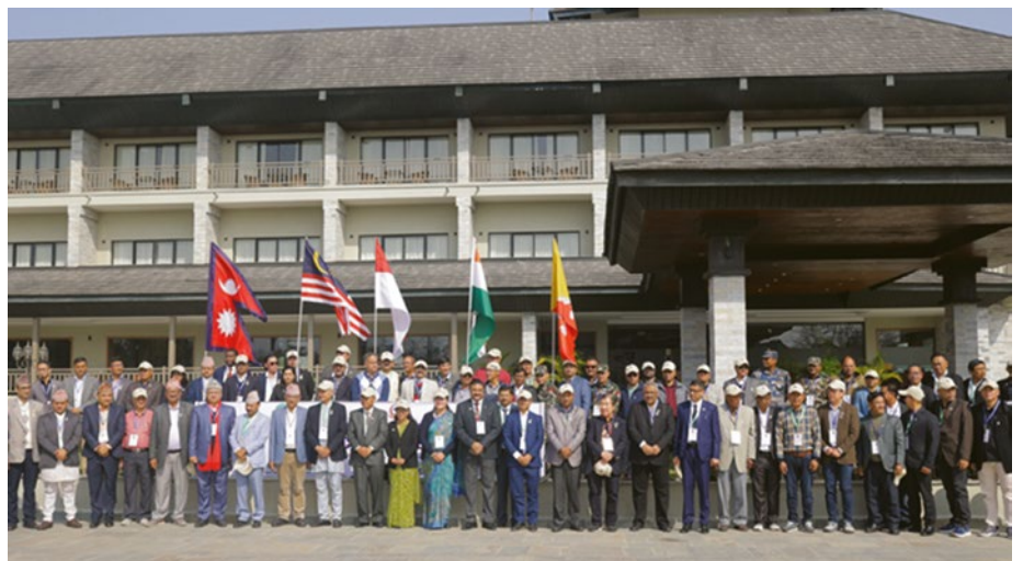
Group photo of delegates at the 3rd Asian Rhino Range States Meeting held in Chitwan NP, Nepal from 3-5 February 2023