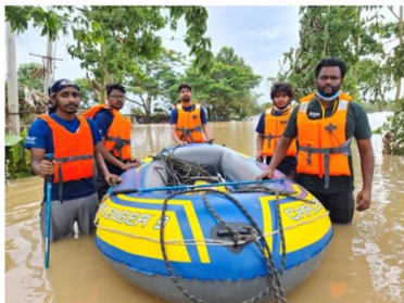
Emergency Relief Network (ERN)