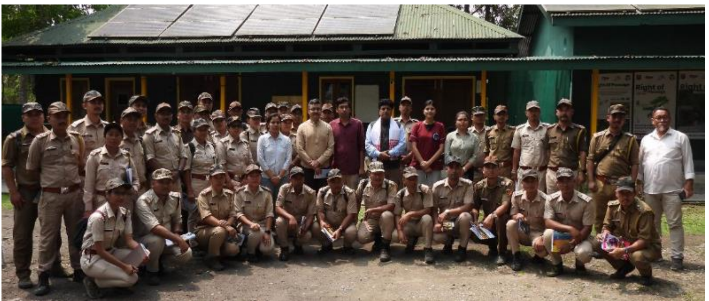
Figs: Top left (7): a barking deer fawn being nursed at CWRC, top right (8): a rescued crested serpent eagle getting examined, middle left (9): rescued whistling ducklings being brought at CWRC: middle right (10): rescued jungle cat kittens admitted at CWRC: bottom (11): capacity building training of forest officials at CWRC