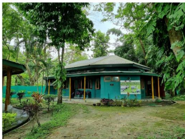
Rescue and Rehabilitation center