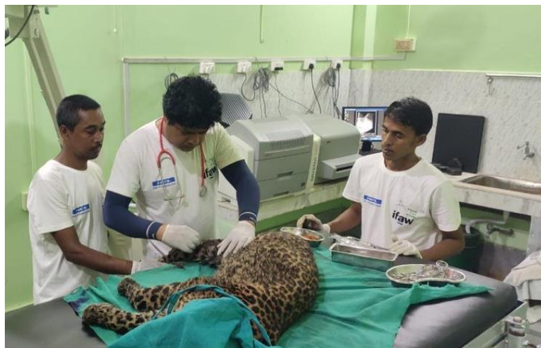
Figs: Top left (1): two greater one horned rhino at CWRC, top right (2): Elephant calves at CWRC, middle left (3): rehabilitating a greater adjutant stork chick at CWRC, middle right (4): released oriental pied hornbill sighted at CWRC campus: bottom left (5): An admitted hog deer being treated by centre veterinarian at CWRC: bottom right (6) an admitted leopard being treated by centre veterinarian at CWRC