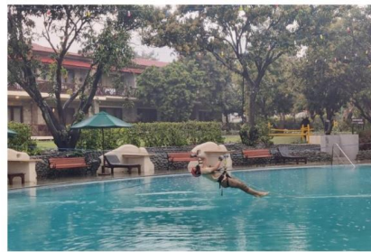
Training and capacity building