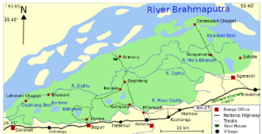
Figure 1: Map of Kaziranga National Park, with Brahmaputra River in the north and NH 37 in the south

Kaziranga National Park and Tiger Reserve (KNP) (26°35'–26°45'N and 93°05'–93°40'E) is situated in the floodplain of the Brahmaputra river in Nagaon and Golaghat districts of Assam, India. Covering an area of 1085.53 km 2 it is the largest protected area on the southern bank of the Brahmaputra River. A proclaimed UNESCO 'World Natural Heritage Site', Kaziranga holds the largest population of One horned rhinoceros globally from a few individuals during the beginning of the 19 th century and is regarded as one of the greatest conservation success story of the world. Kaziranga National Park supports 35 mammalian species (includes 18 threatened species) and close to 500 species of birds.