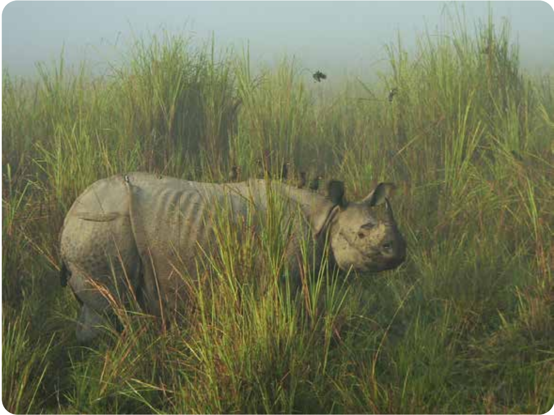
Indian rhinoceros ( Rhinoceros unicornis ).

The white rhinoceros Ceratotherium simum and black rhinoceros Diceros bicornis ranging in Africa are listed in Appendix I, except for the white rhinoceros populations of Eswatini and South Africa which are listed in Appendix II for trade of live animals and hunting trophies.