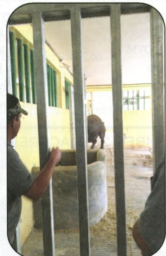
Inside the rhino's air conditioned night house and management area.