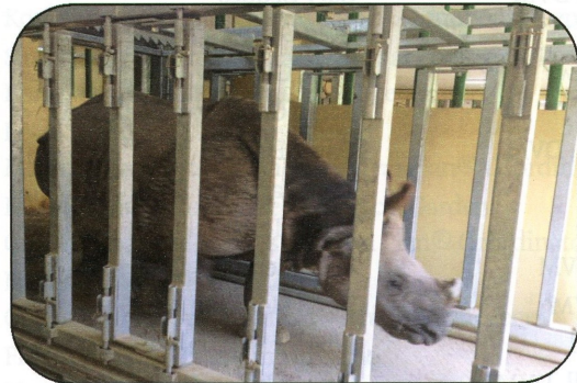
ASHA in TAMER®, Al Bustan, Oct. 2013

MISSION STATEMENT: Strive to be a sustainable zoo, based on sound conservation principles and ethics. An institution dedicated to the promotion of education, conservation, breeding endangered species and research. The 17ha zoo is home to hundreds of animals including over 652 ungulates representing 32 species, and a pair of Indian rhinos recently acquired from the San Diego Zoo. The rhino exhibit and management area comprise a .5ha habitat with a deep pool and a cooled holding area and night house.