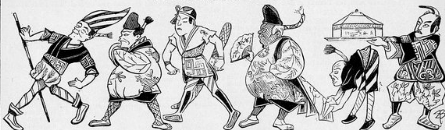
THE JAPANESE AMBASSADORS.

THOUGH Britain is a changeful clime, Whose natives oft in Autumn time Seek coals and flannel; Still to its hospitable shore Full many strangers venture o'er The stormy Channel.