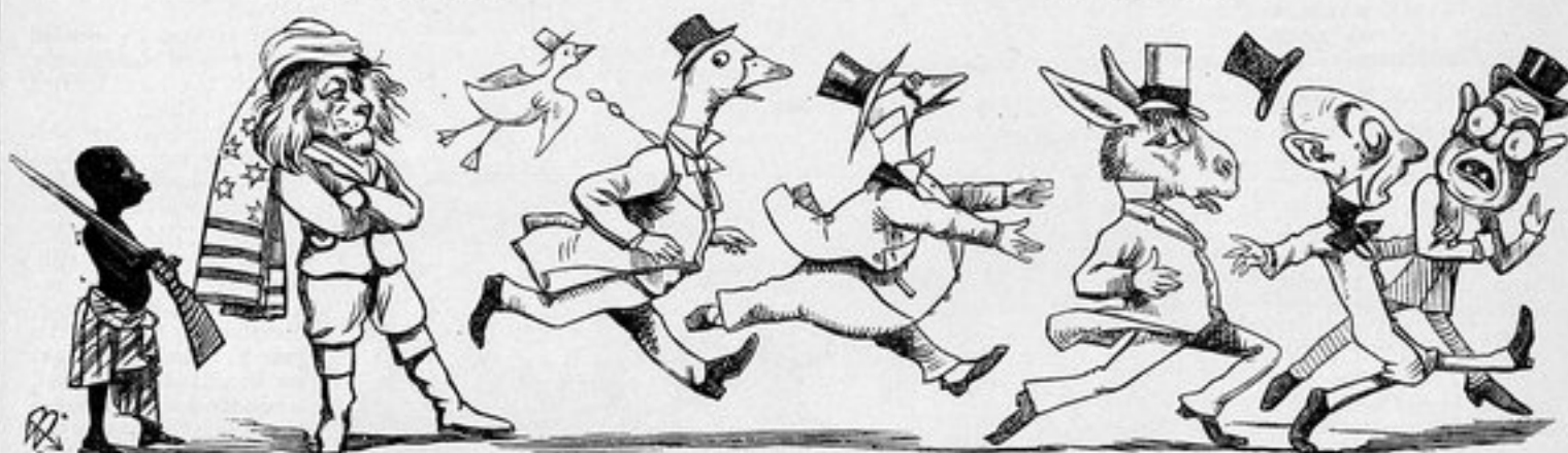
"THE YOUNG AFRICAN LION."

Of visitors so distingue Fun offers in a friendly way His panorama; And first the public eye regales With that proud Embassy which hails From Yokohama.