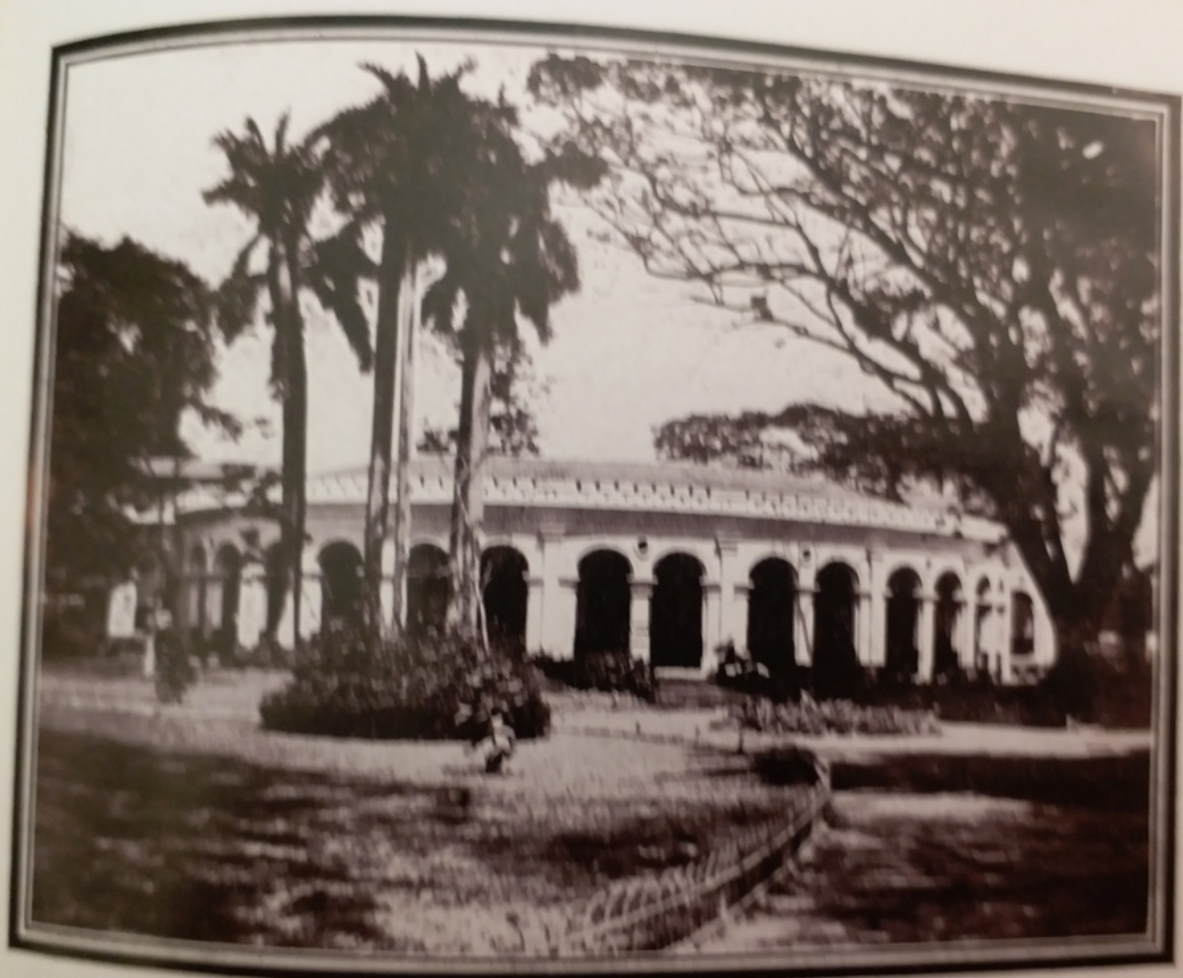
(13.) BURDWAN HOUSE.