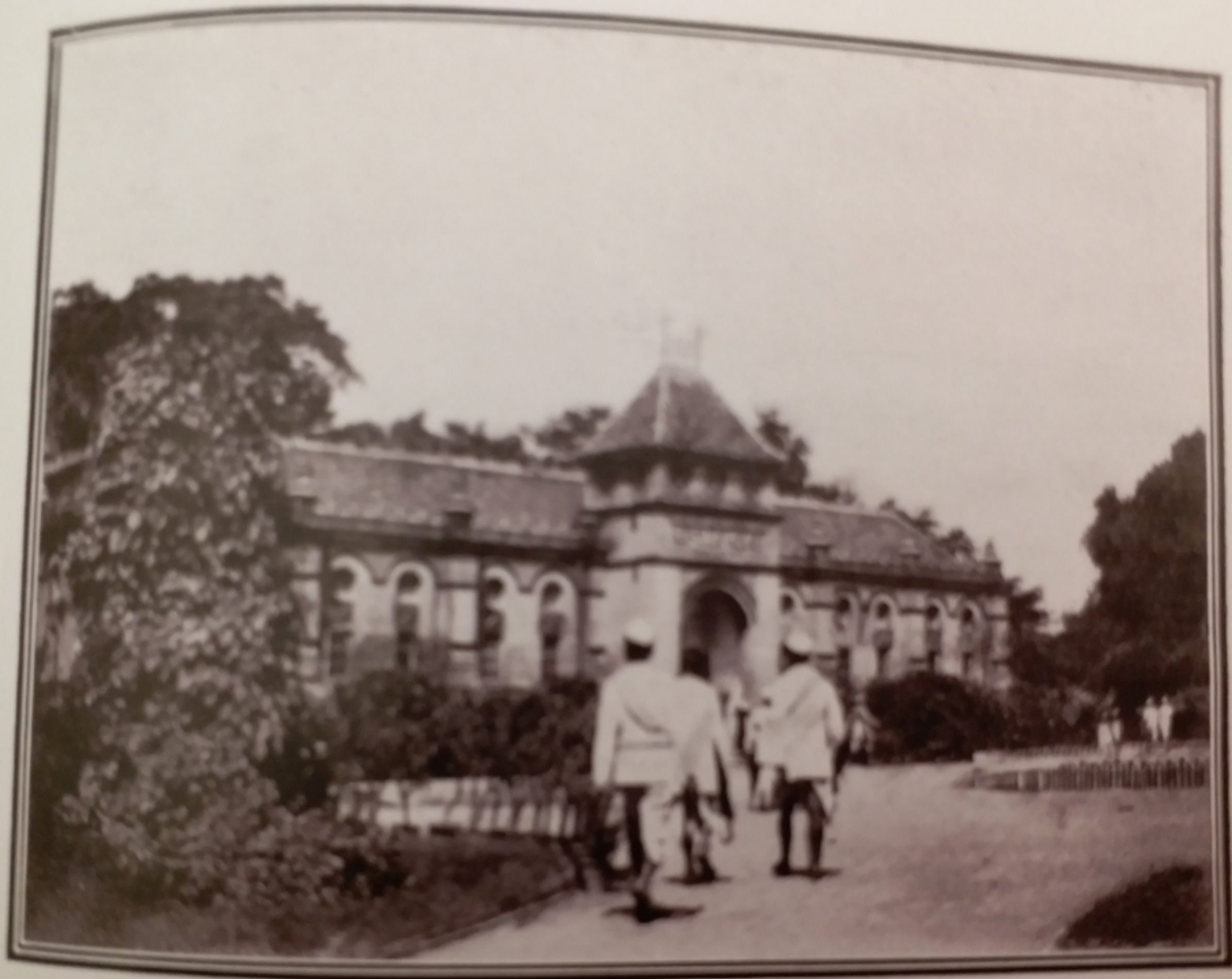
(11.) THE REPTILE HOUSE.