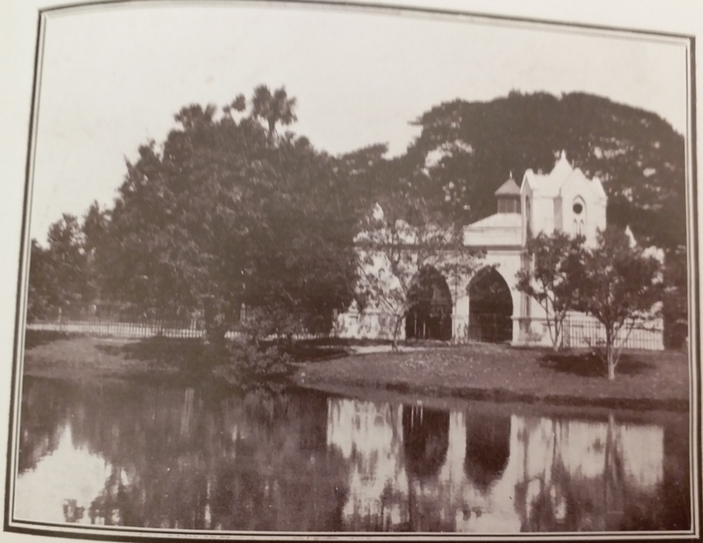
(10.) EZRA HOUSE.