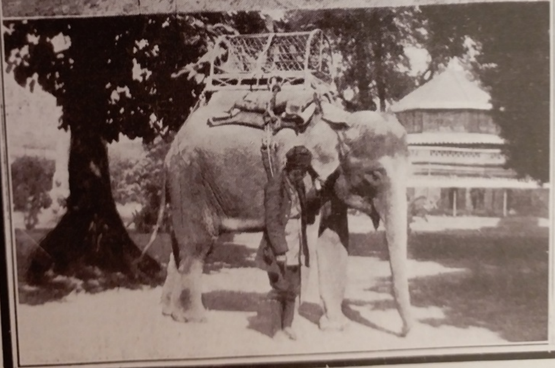
(5.) THE RHINOCERI.