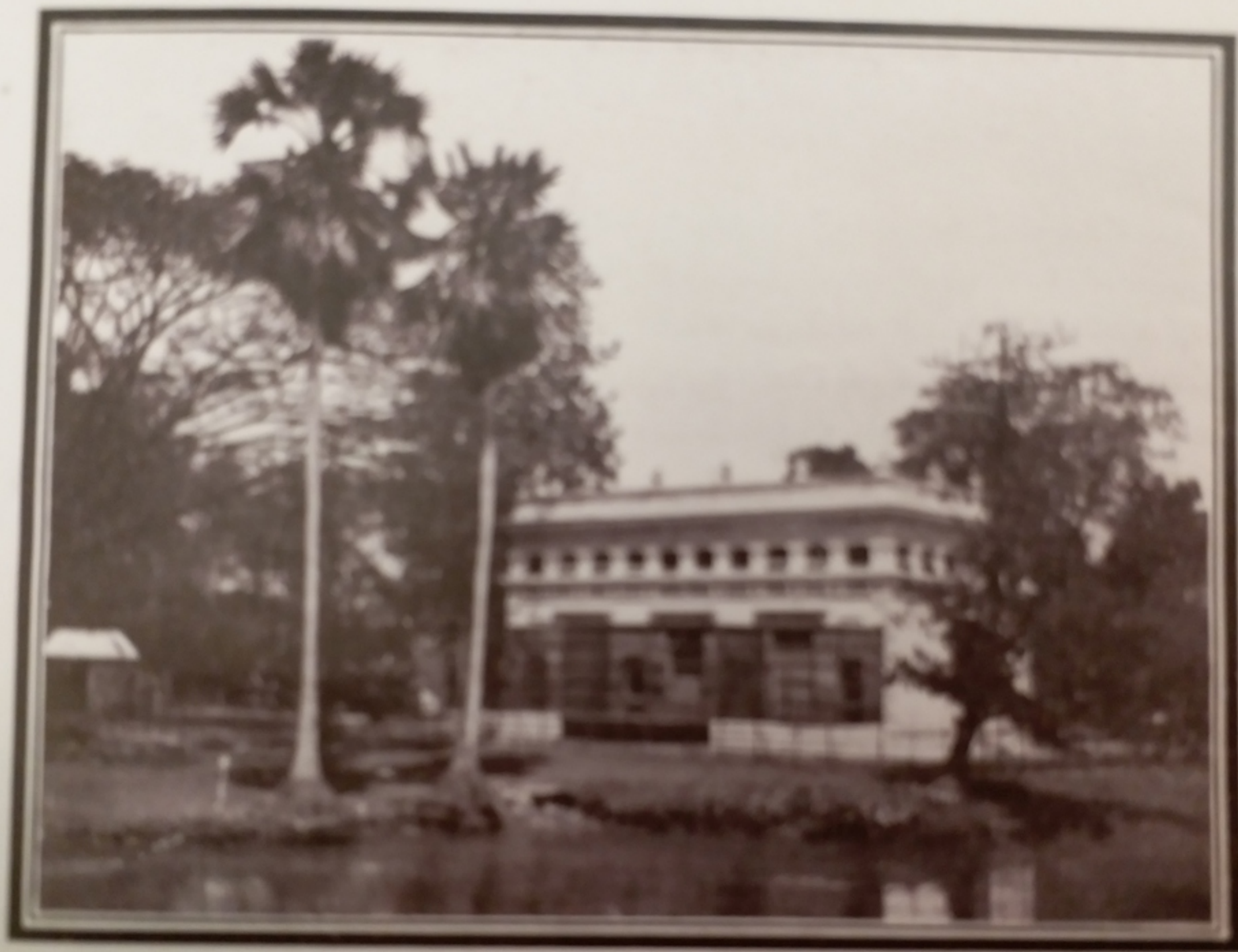
(4) GENTRY HOUSE.