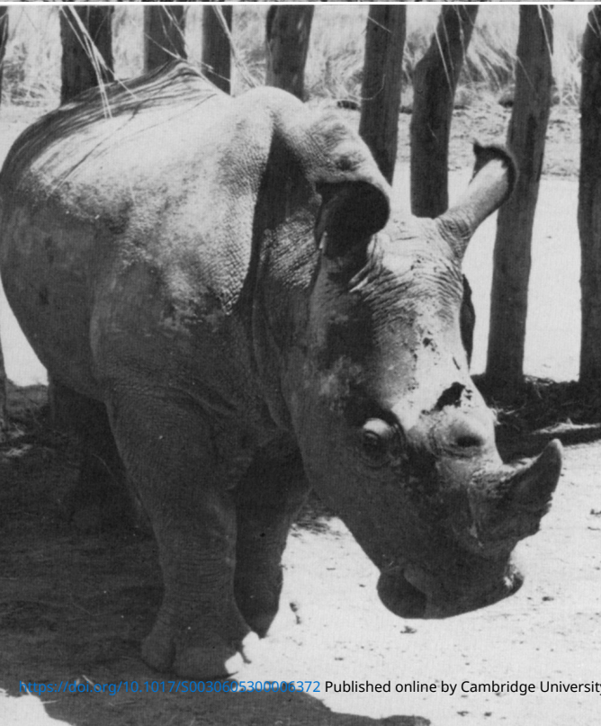
Plate 16 left: White rhino in the boma and ready for release.