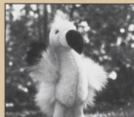
A flamingo for your own How you can help CRES. See page 5.