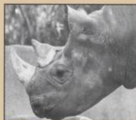
Virology studies for black rhinos Immune responses for a rare species. See page 3.