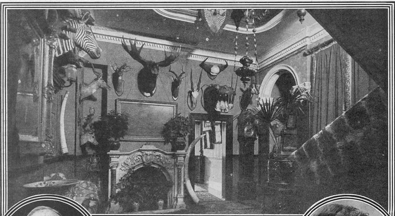
THE FRONT HALL OF BRANDESBURTON

This fine apartment is a veritable museum—a magnificent pair of tusks, 110 lb. each, adorn one mantel, while a fine pair of cow elephant's tusks, 36 lb., grace the other. Some fifty cases of rare animals and birds are grouped round the room, with fine heads above; rare Indian rugs presented by Indian friends are covered with equally rare skins—to mention a few only are the okapi, white rhino, bongo, Congo bush buffalo, giant pig, Harrison's antelope, lions, leopards, tigers; and there are lovely china and embroideries