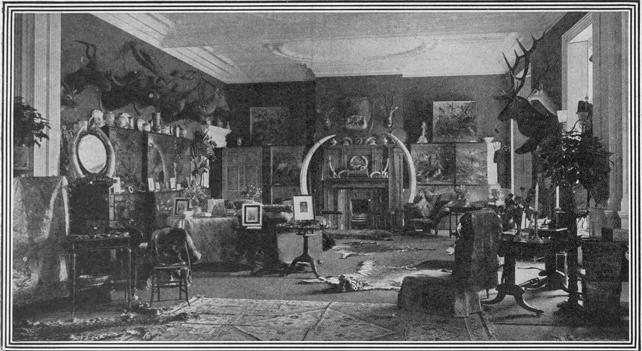
THE SALOON OF BRANDESBURTON HALL—THE HOME OF MANY TROPHIES

This fine apartment is a veritable museum—a magnificent pair of tusks, 110 lb. each, adorn one mantel, while a fine pair of cow elephant's tusks, 36 lb., grace the other. Some fifty cases of rare animals and birds are grouped round the room, with fine heads above; rare Indian rugs presented by Indian friends are covered with equally rare skins—to mention a few only are the okapi, white rhino, bongo, Congo bush buffalo, giant pig, Harrison's antelope, lions, leopards, tigers; and there are lovely china and embroideries